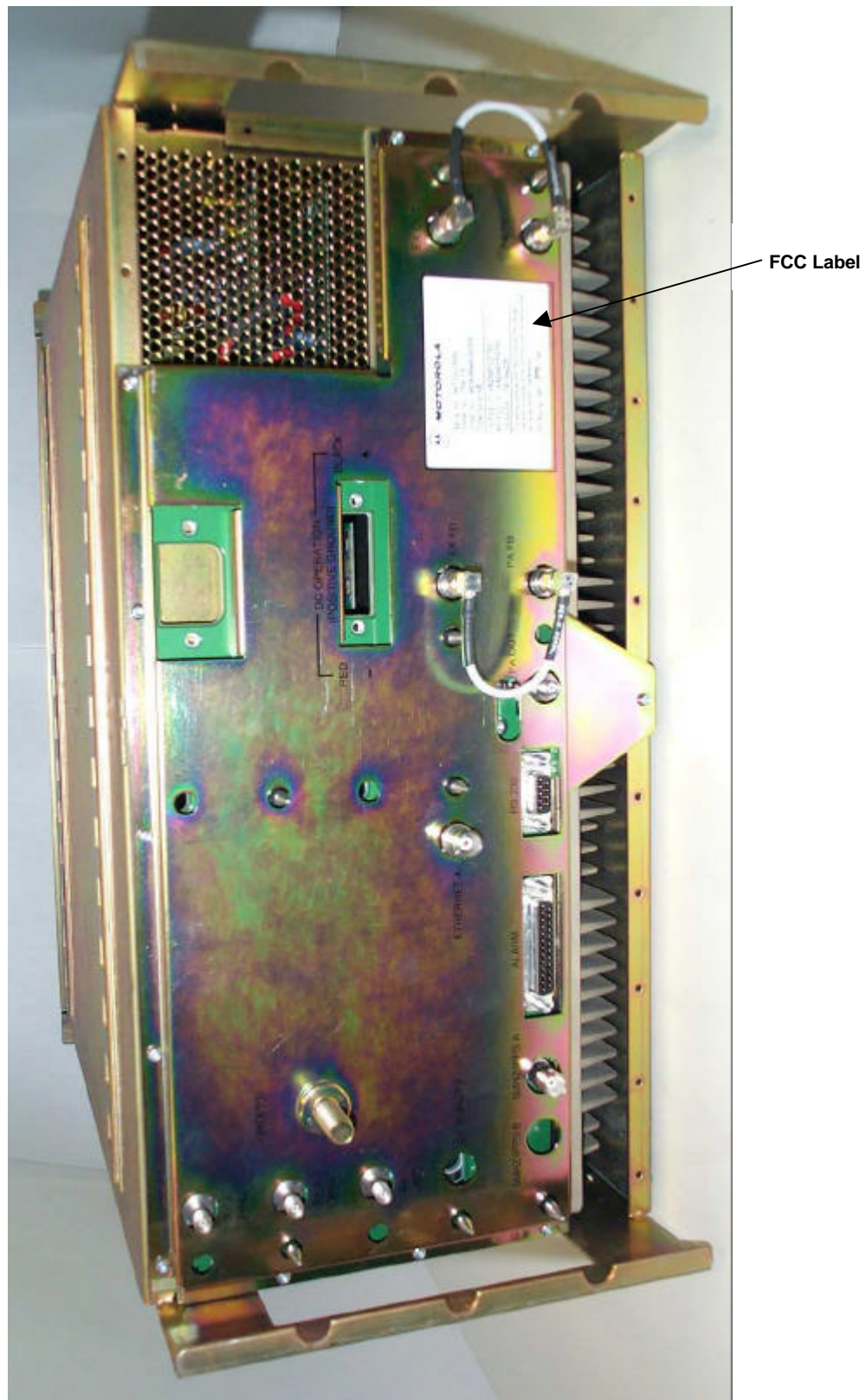
Rear of Base Radio Including Location of the FCC ID Label