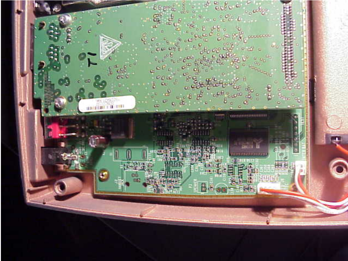
Figure 7: Inside bottom cover with circuit board details – SX5e