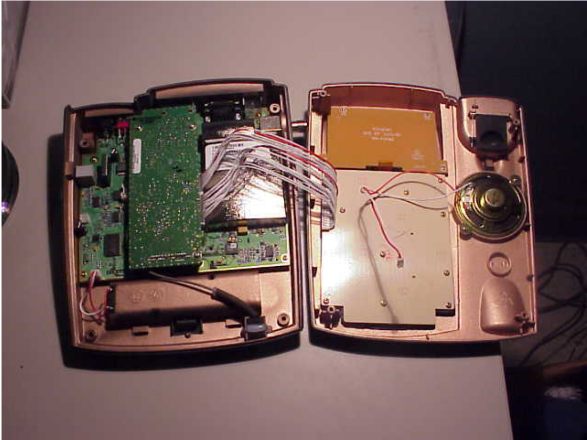
Figure 1: Inside view of top and bottom cover – SX5D