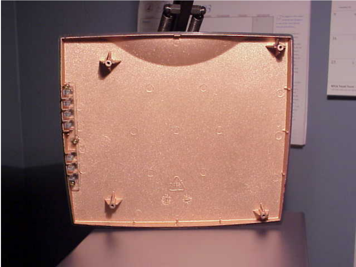
Figure 5: Inside top cover – SX5e