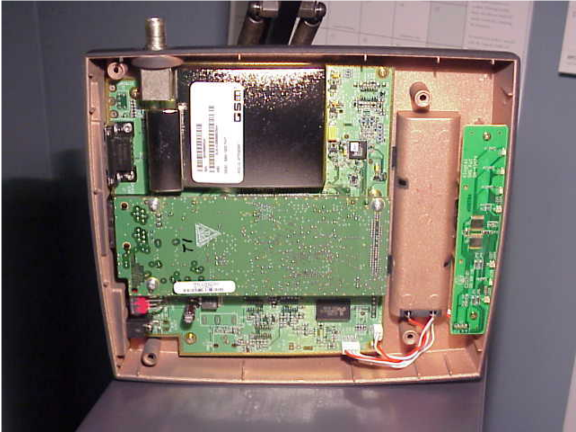
Figure 6: Inside bottom cover – SX5e