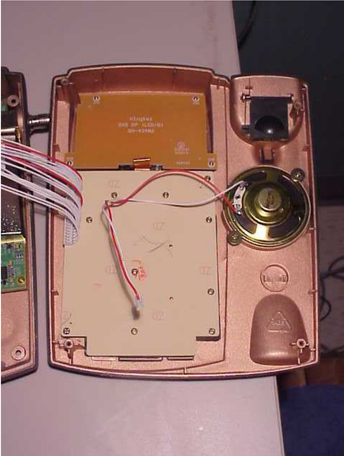
Figure 2: Inside top cover – SX5D