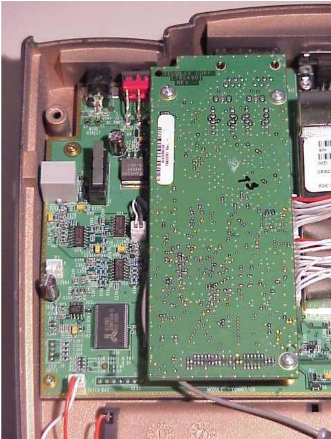
Figure 4: Inside bottom cover with circuit board details – SX5D