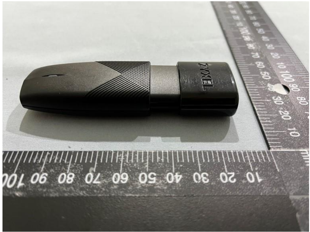
Outview: NWD7605 Pic 8