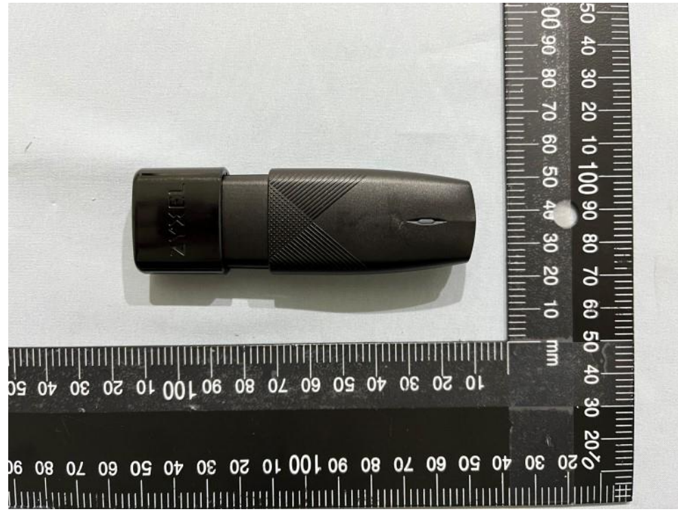
Outview: NWD7605 Pic 2