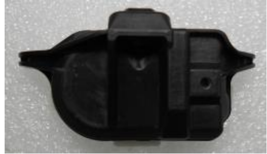
Bottom view of Transmitter