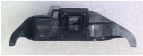
Front view of Transmitter