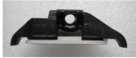
Rear view of Transmitter