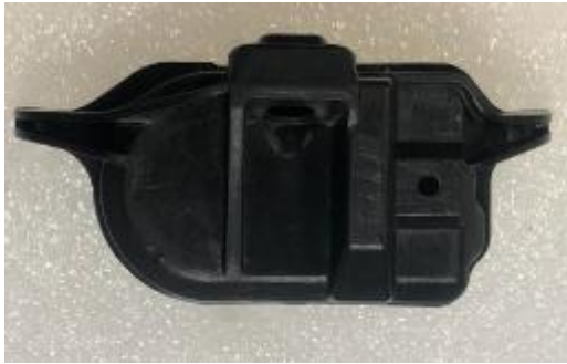
Top view of Transmitter