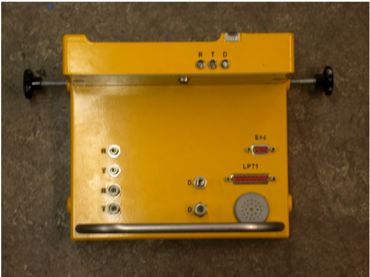
Figure 1. Front site of CUII.

As Mala's lawyer has explained in emails to Mr. Dichoso, we think the digital controller (CUII) is properly treated as a digital device subject only to verification to Class B standards, so the Commission should not require photos and block diagrams. We are submitting these materials anyway to expedite a grant of the present application. But we intend to seek clarification of the rules applicable to digital devices that control UWB transmitters."