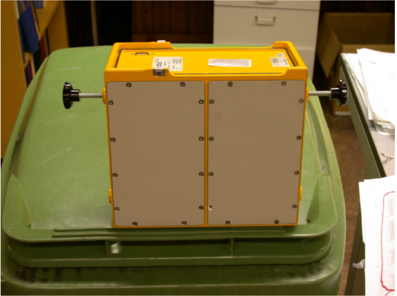
Figure 2. Back side of CUIL.