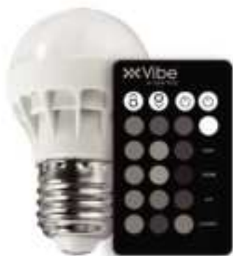
Operation Manual FB-BAPP