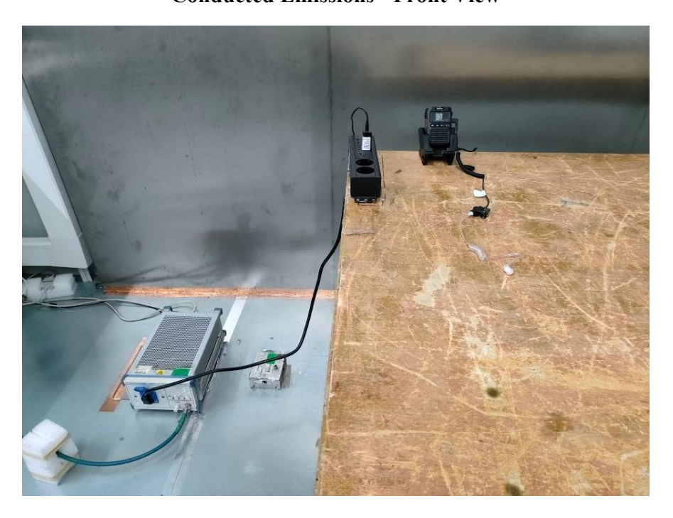
Conducted Emissions - Side View