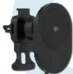
Qi2 Magnetic Wireless Charger Car D481H