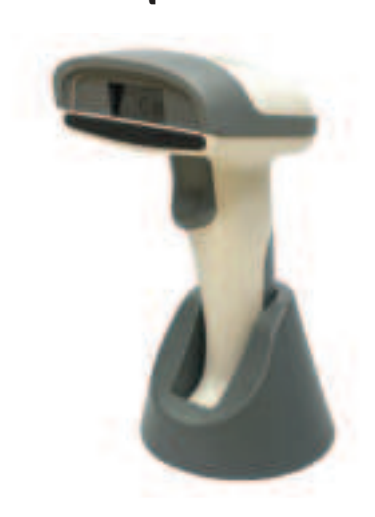
2D WIRELESS SCANNER QUICK GUIDE (REV1)