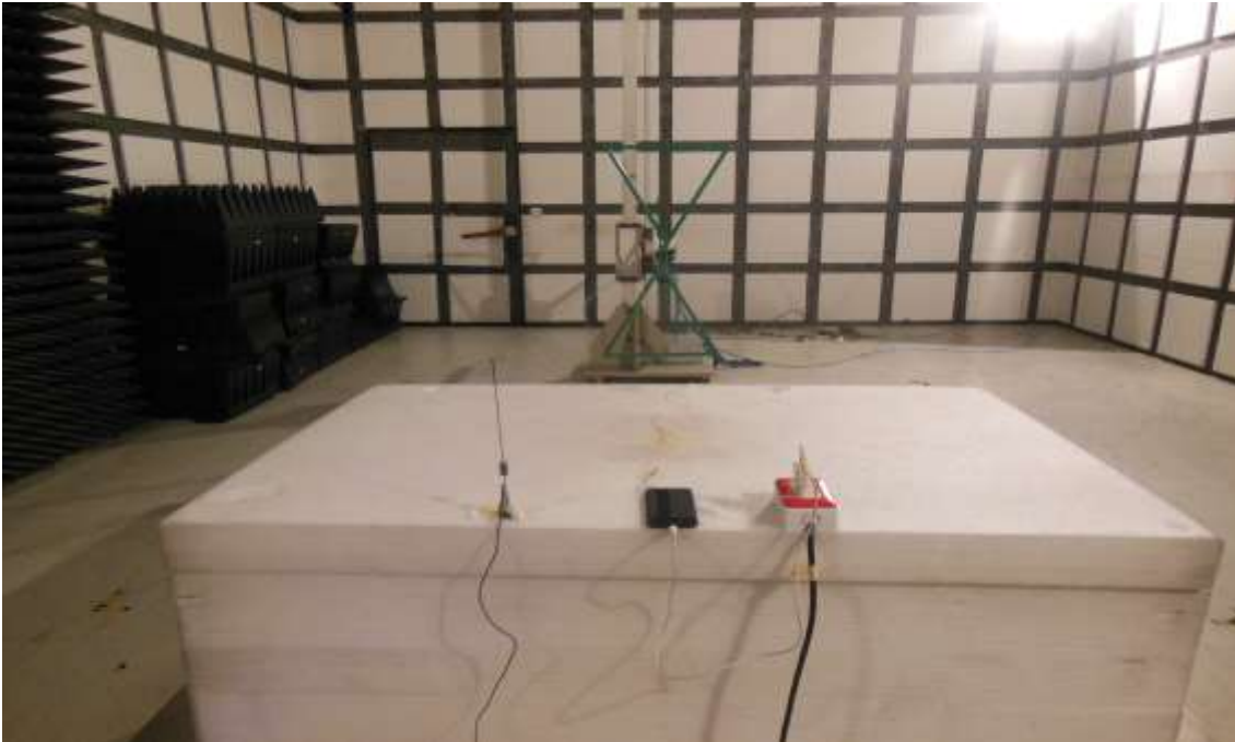
Radiated Spurious Emission (30MHz to 1GHz)