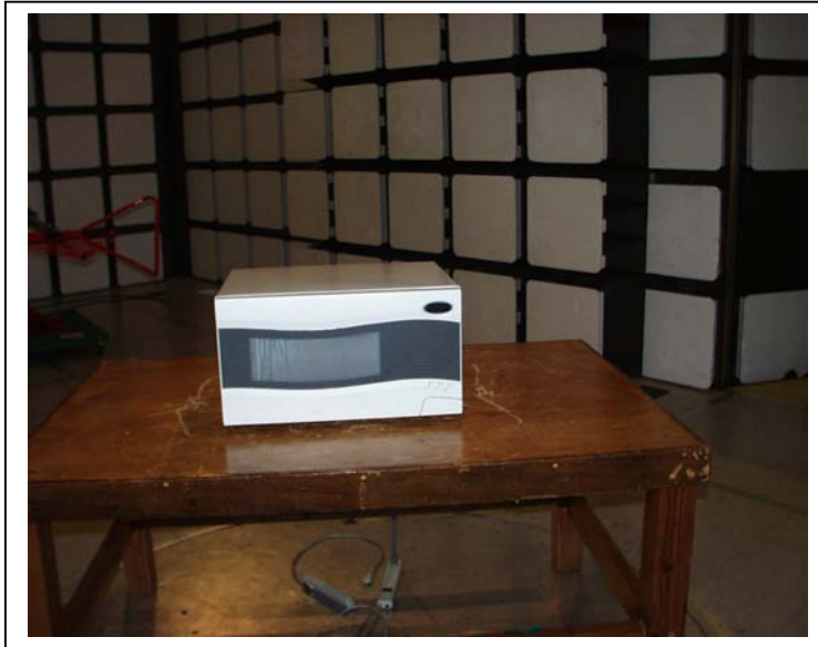
Radiation Measurement Below 1GHz