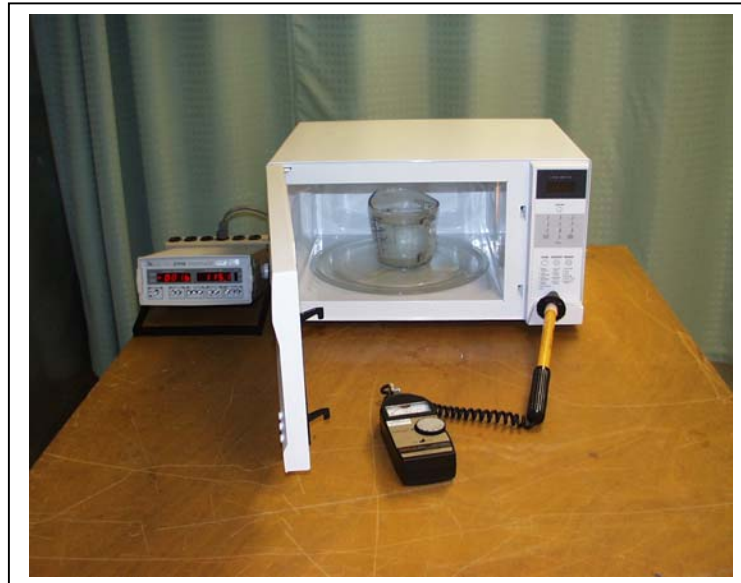
Radiation Hazard Measurement