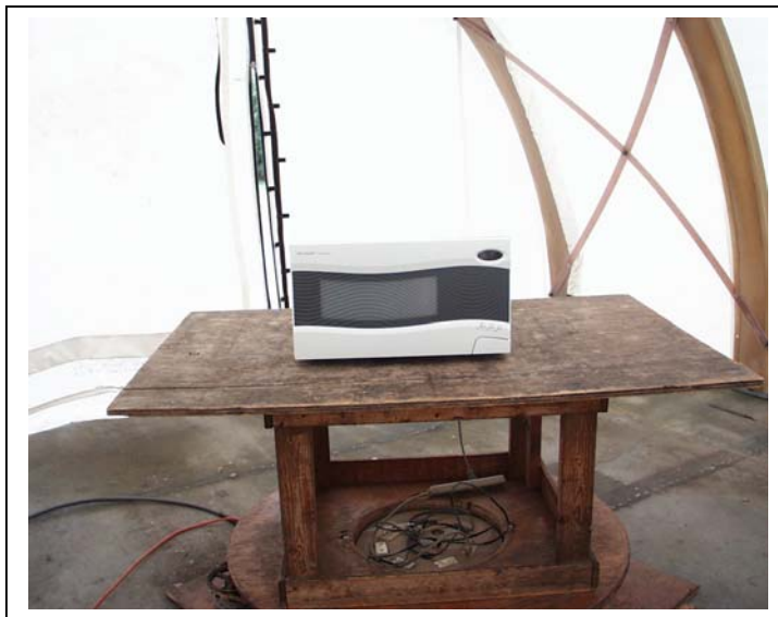
Radiation Measurements Above 1GHz