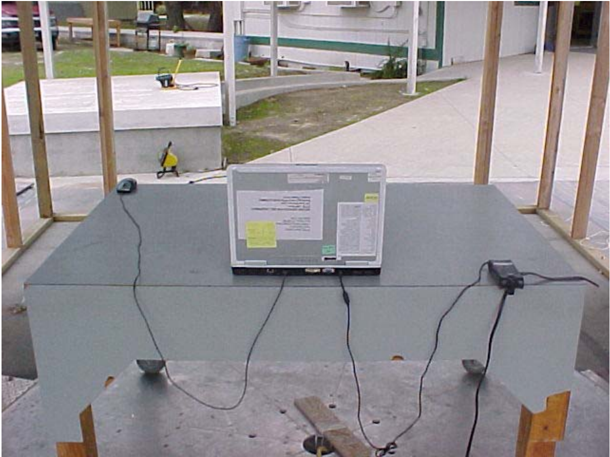
Radiated Emissions Measurement (30-1000 MHz) (Rear View) Setup