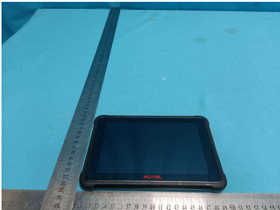
View of Product-2