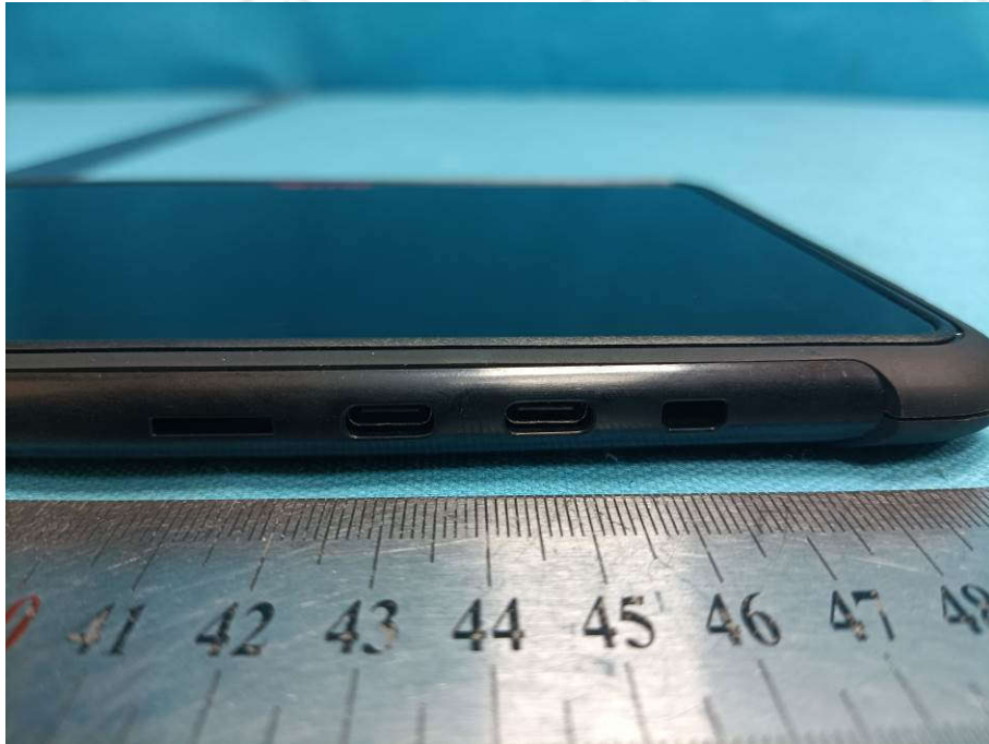
View of Product-7