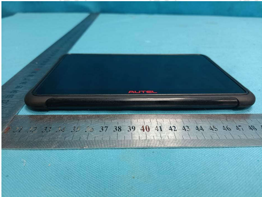
View of Product-4