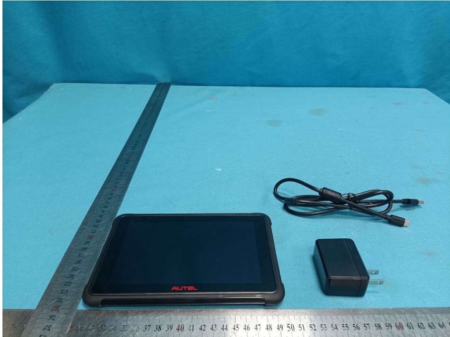
View of Product-1