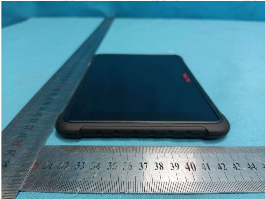
View of Product-8