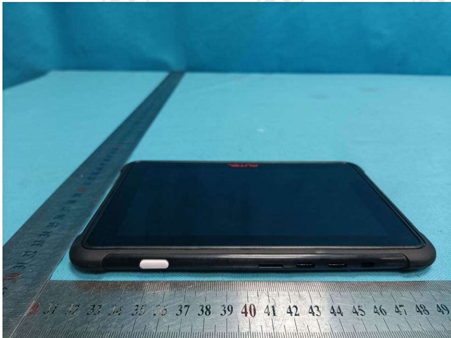
View of Product-6