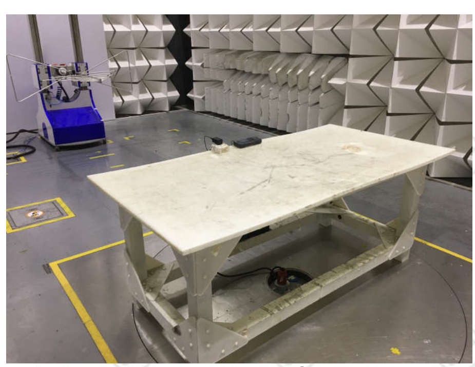
Radiated spurious emission Test Setup-2(Below 1GHz)