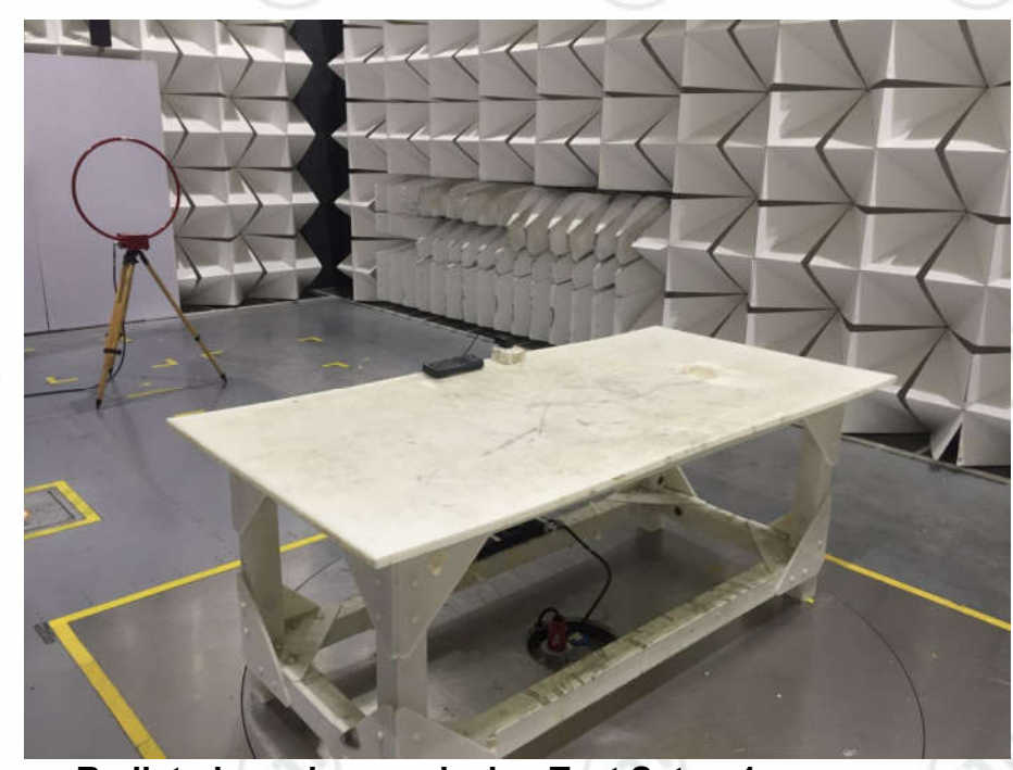
Radiated spurious emission Test Setup-1(Below 30MHz)