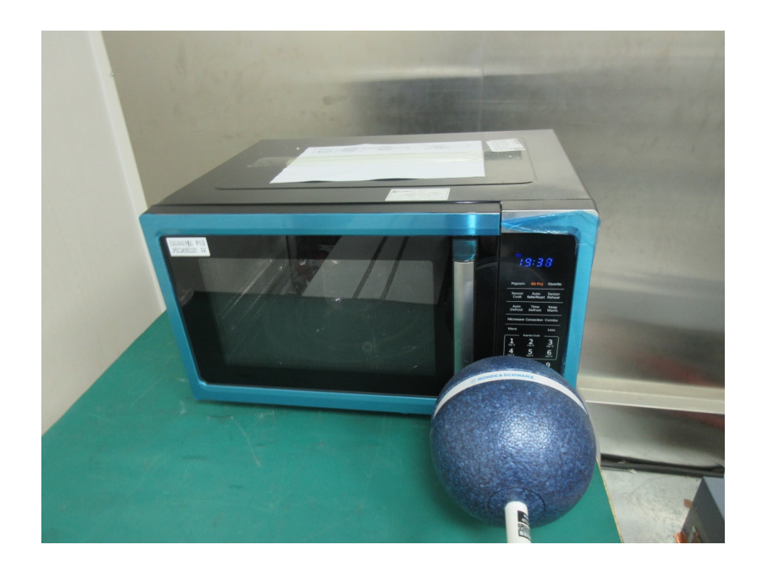
End of the report