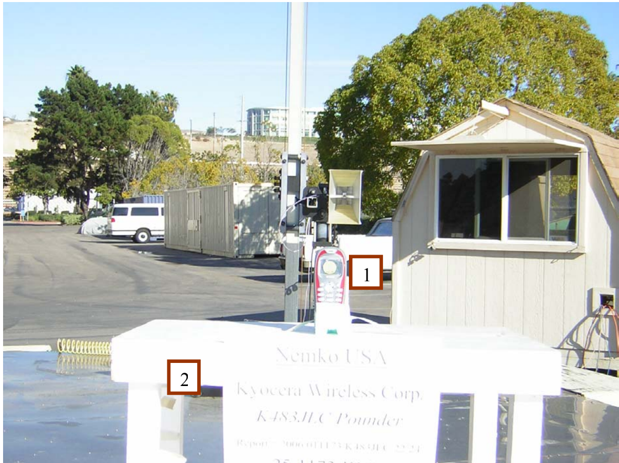
Figure 1. General EUT Test Setup Picture