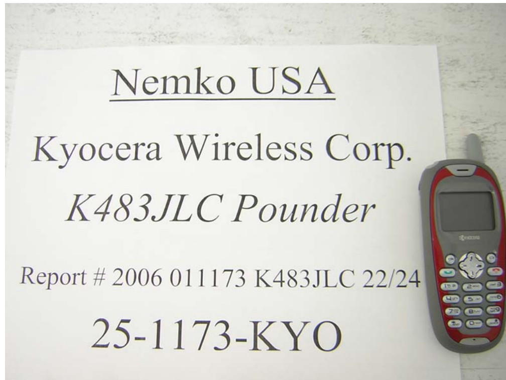
Photograph 1. K483JLC Pounder , Tri Mode Mobile Cellular Phone