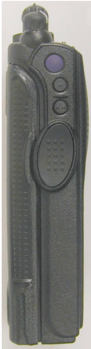
SIDE VIEW (LEFT)