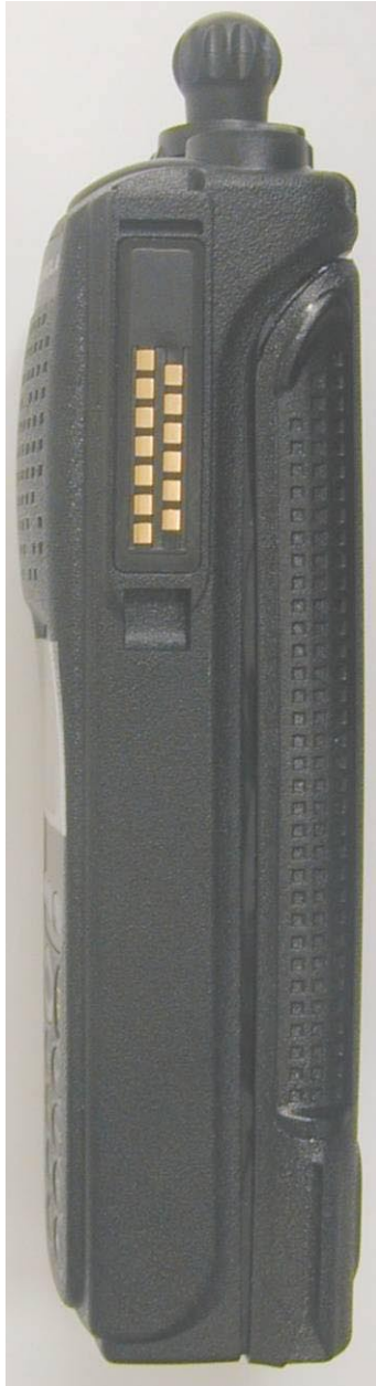
SIDE VIEW (RIGHT)