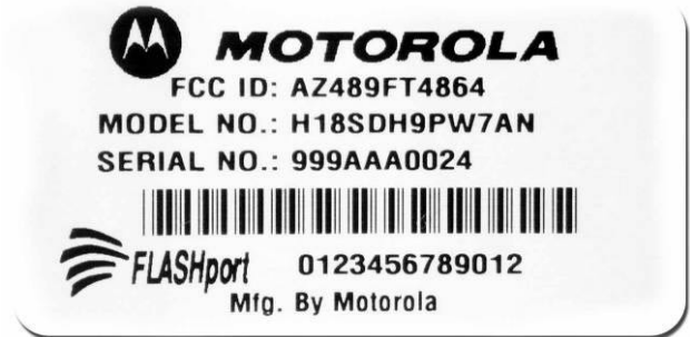
BACK VIEW (FCC LABELS)