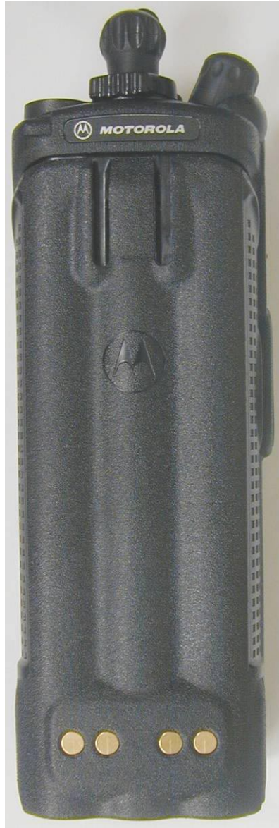
BACK VIEW WITH BATTERY