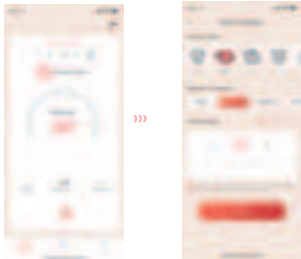
4. Successfully connected to Click "Choose Food" Choose the food 5. Choose the food that needs to be cooked