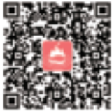
iOS 11.0 and above

Search the keyword "AIBBQ" in App Store or Google play or scan the following QR code. NOTE: The APP does not have a cloud server and will not collect personal information from users. Please rest assured to use it!