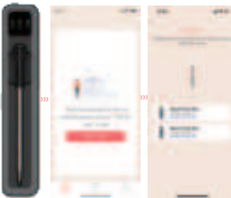
1. Turn on the device and open the APP (AIBBQ) 2. Open the APP and click "Add Device" 3. Find the device