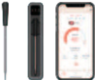
PROBE Host/Signal Amplifier AIBBQ APP

Thank you for purchasing and using our wireless smart meat thermometer. Please read this manual carefully before using this product.