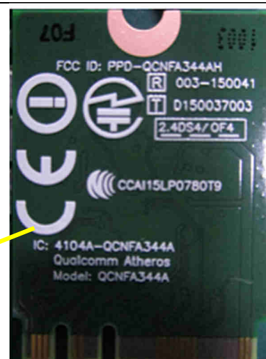
Underside of module