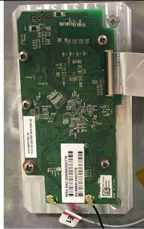
Access WiFi module in lid