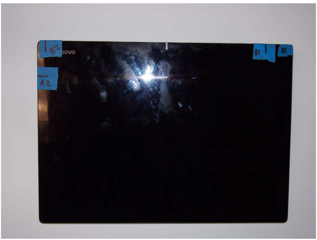
Front of Device Tablet Mode