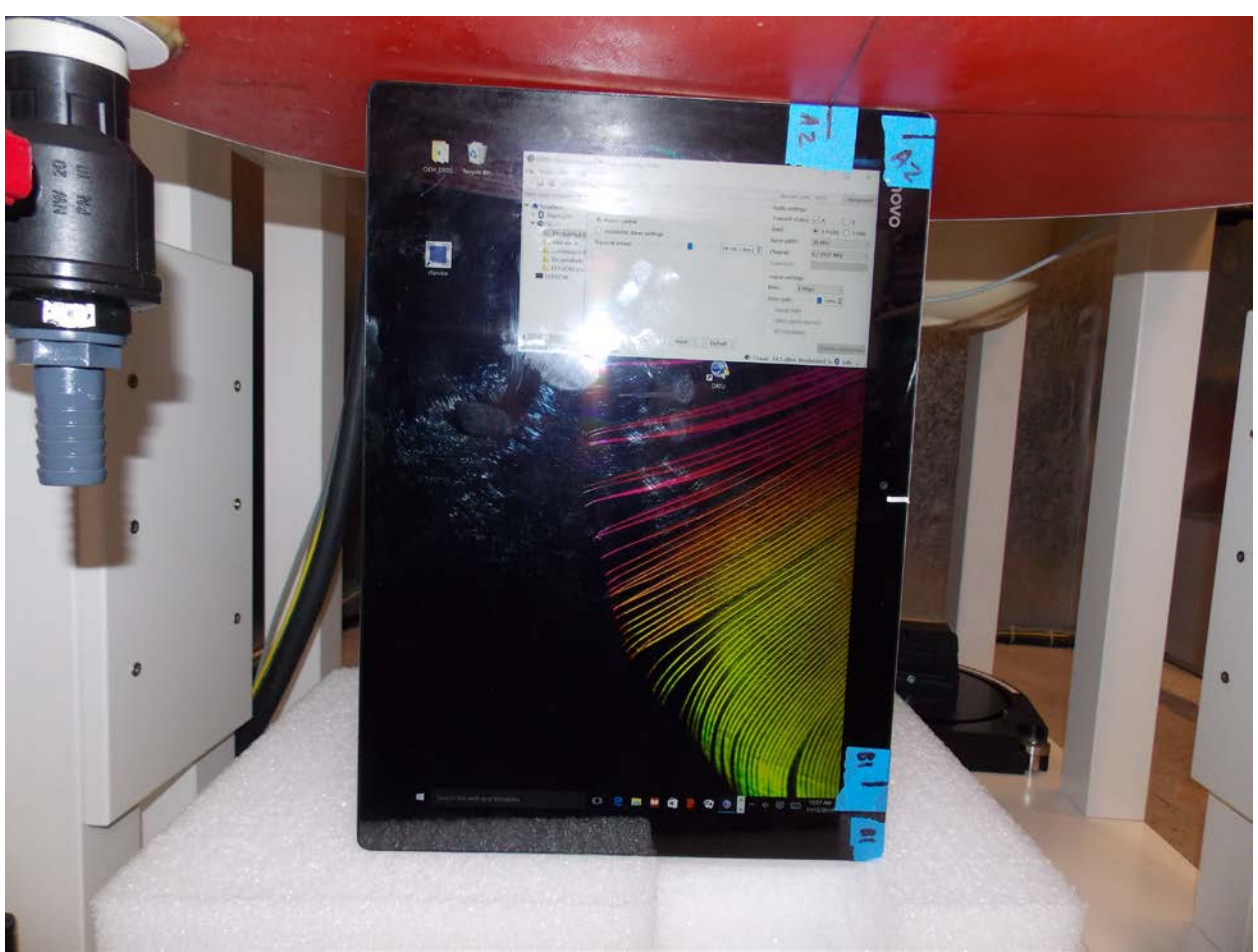
Test Position Left Side 0 mm Gap