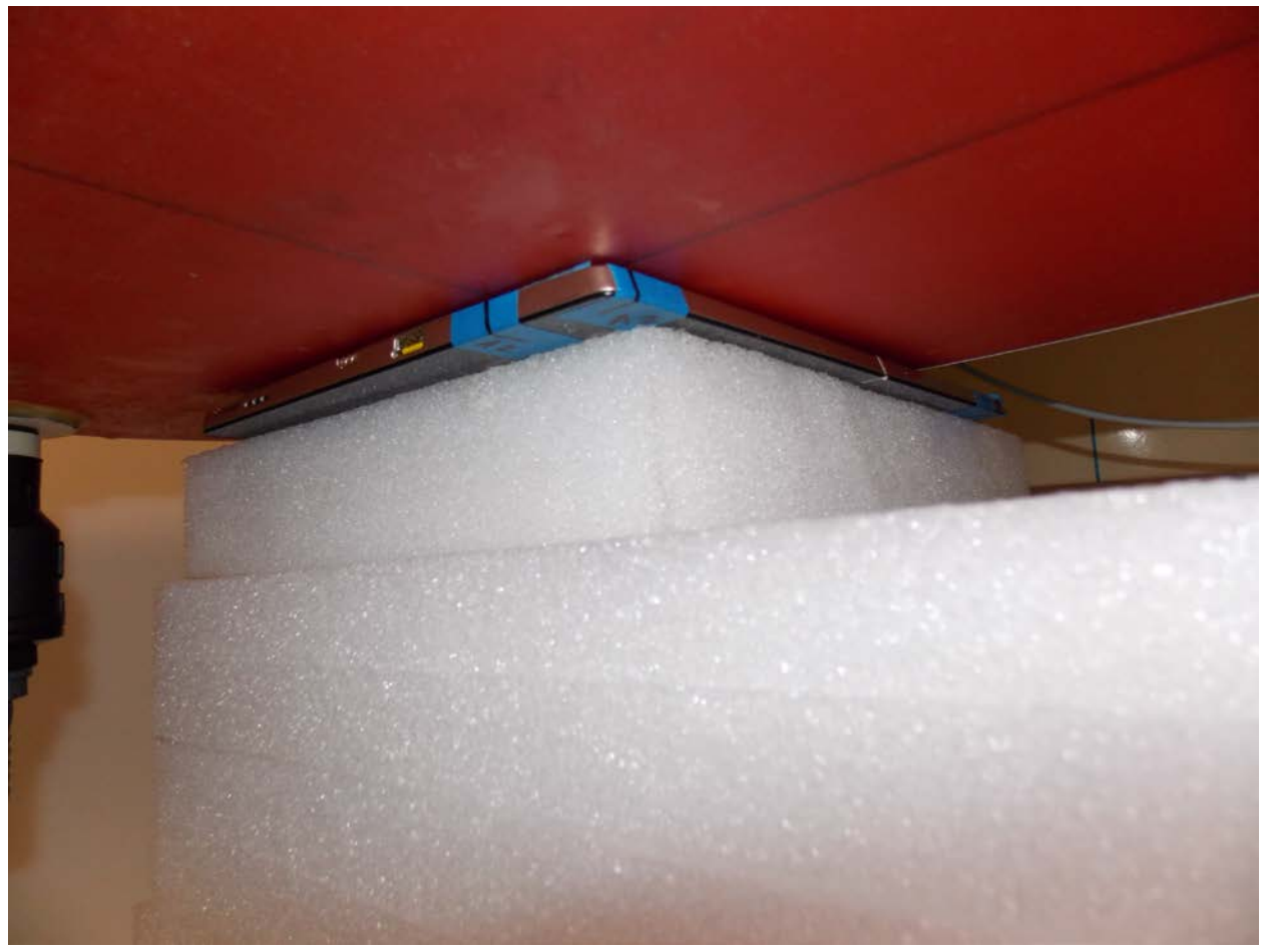
Test Position Tablet Back 0 mm Gap