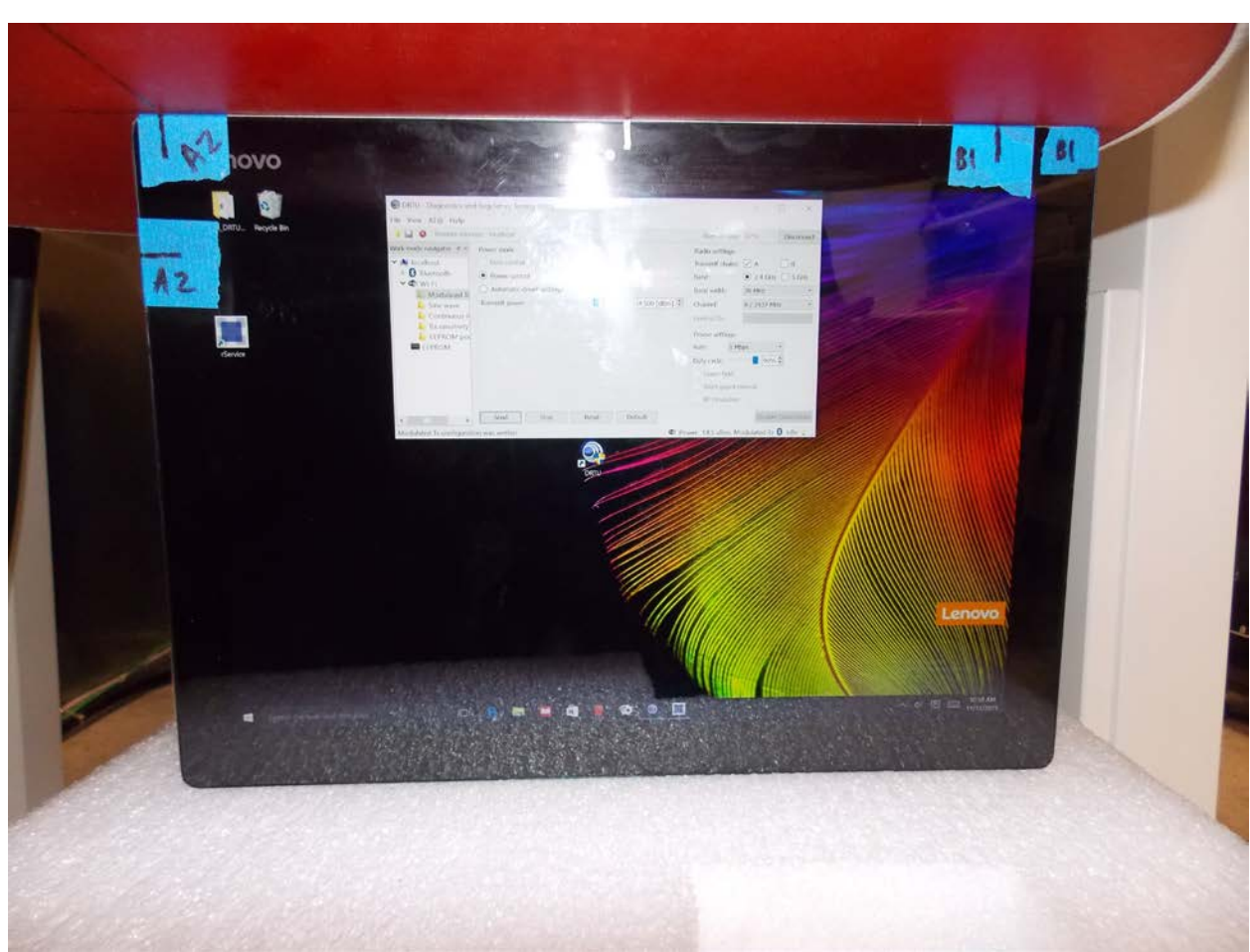
Test Position Front Edge 0 mm Gap