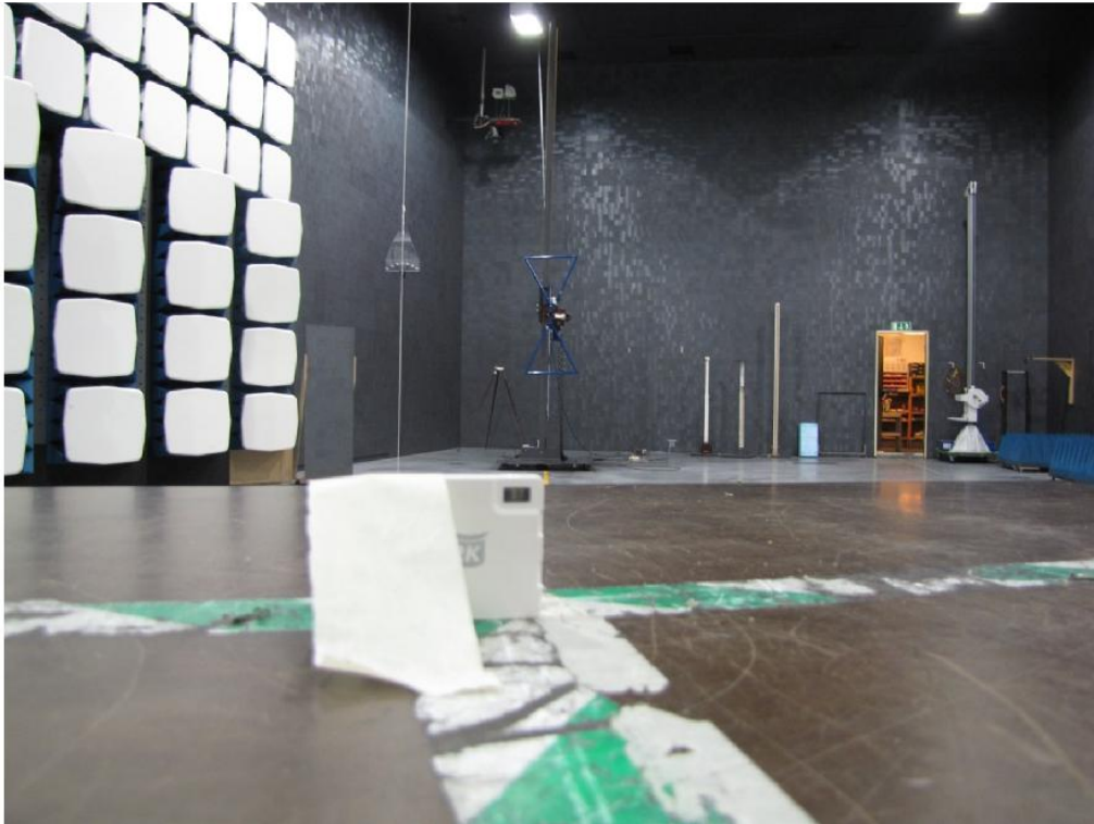
Test set up radiated emission 30 MHz – 1GHz