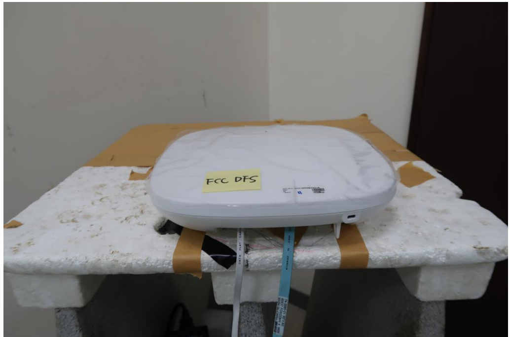
Serving Radio Secondary