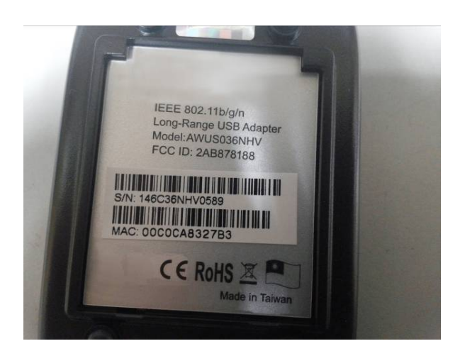
Proposed FCC ID Location