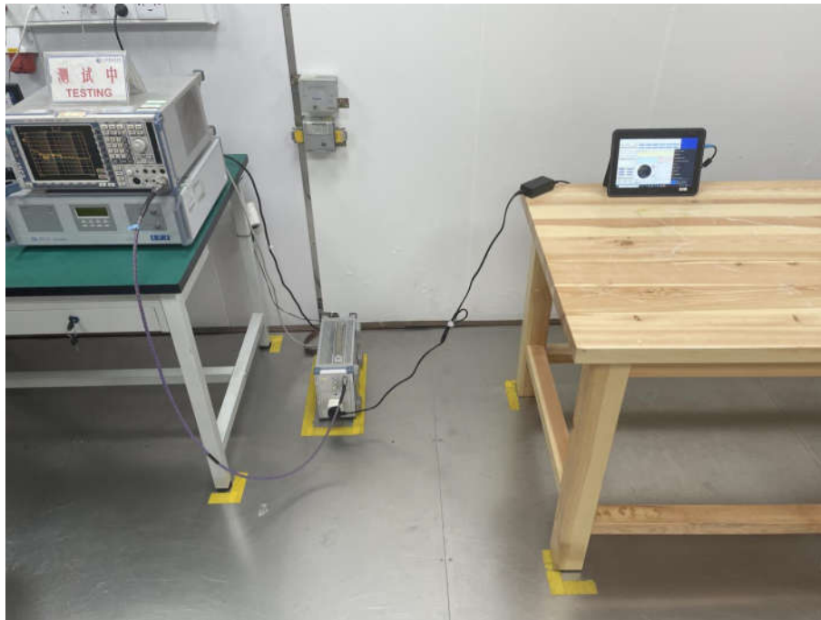
Conducted emission Test Setup