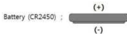
Figure 15. Battery Directional