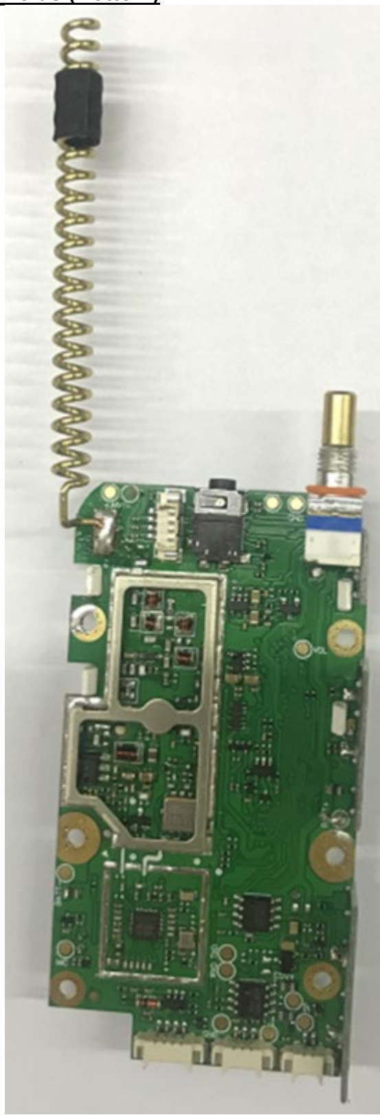
T470 and T475