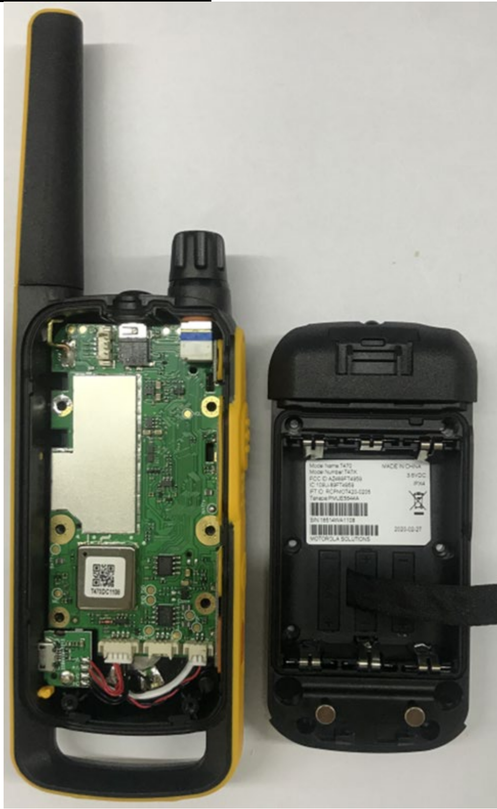
T470 and T475