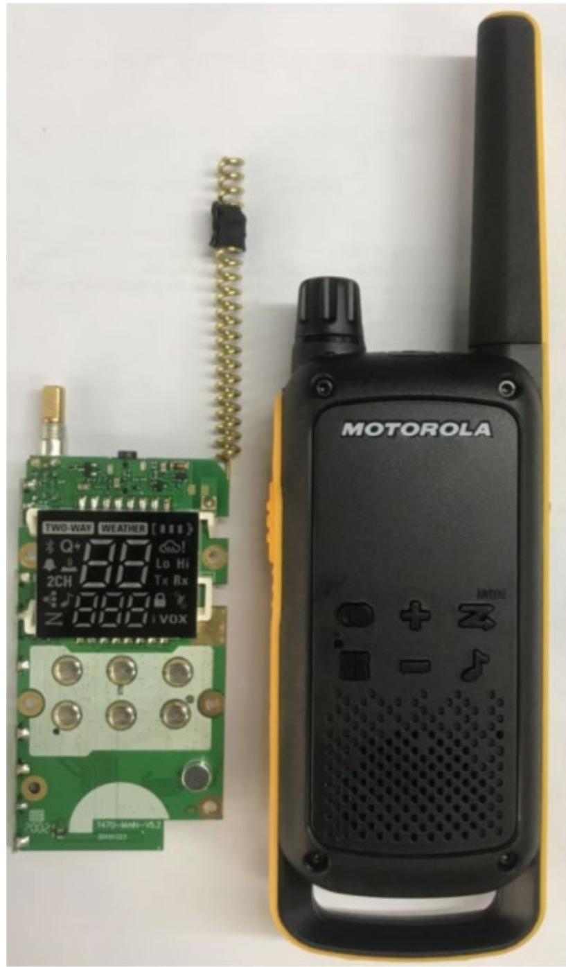
T470 and T475