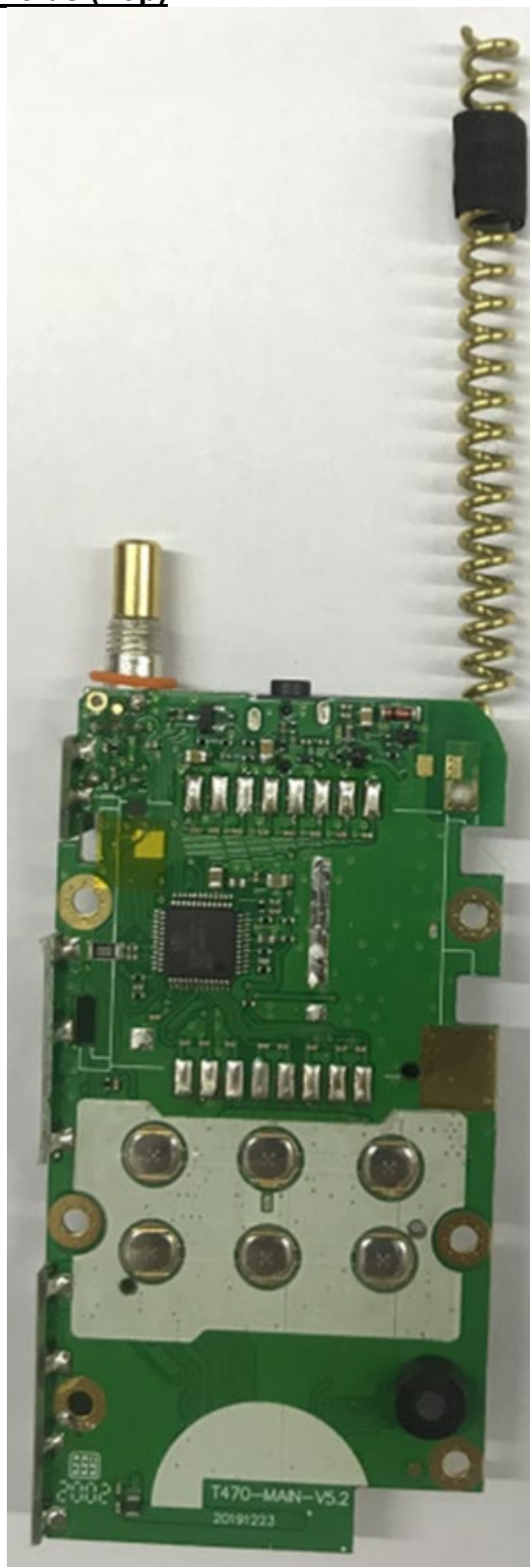
T470 and T475