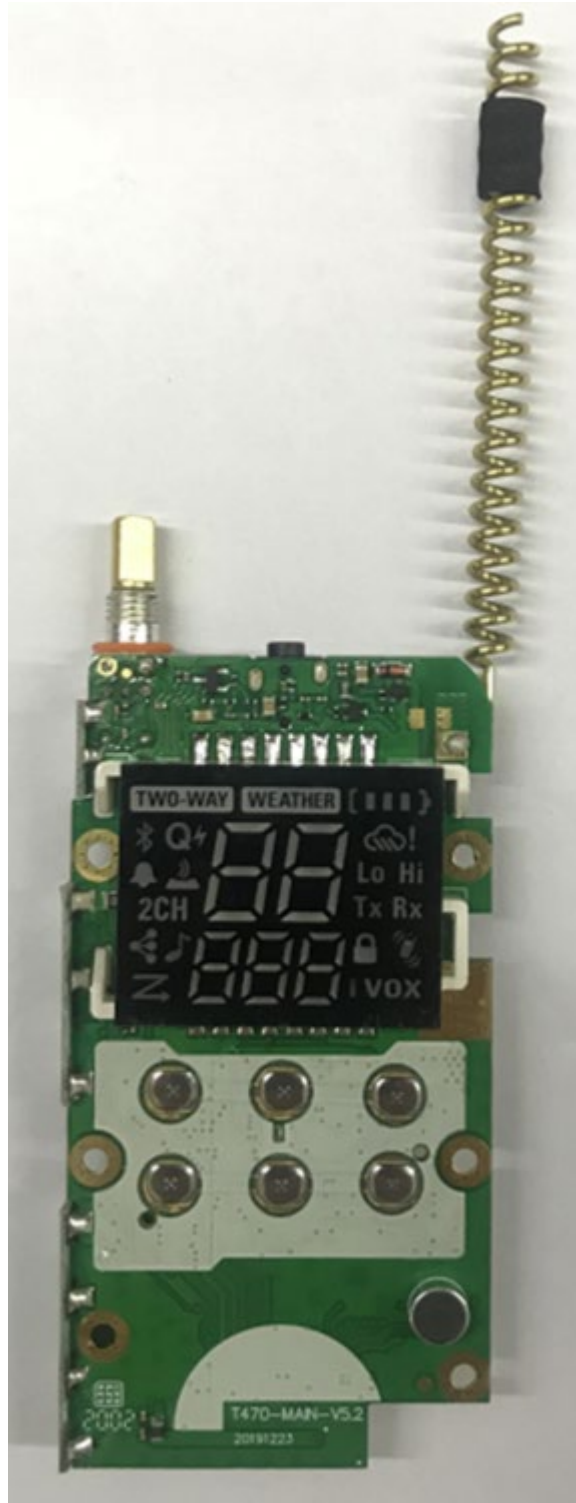
T470 and T475