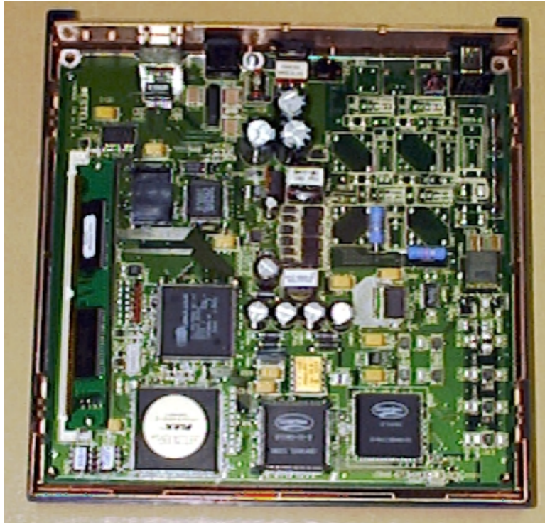
Foil Side of Circuit Board