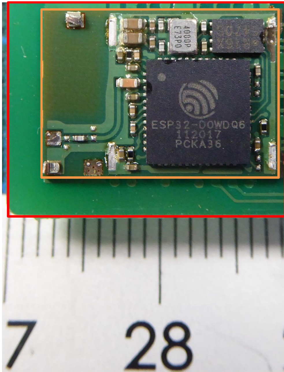
170297_E8_21.jpg: EUT (with onboard antenna removed) without shielding on not marketed eval board