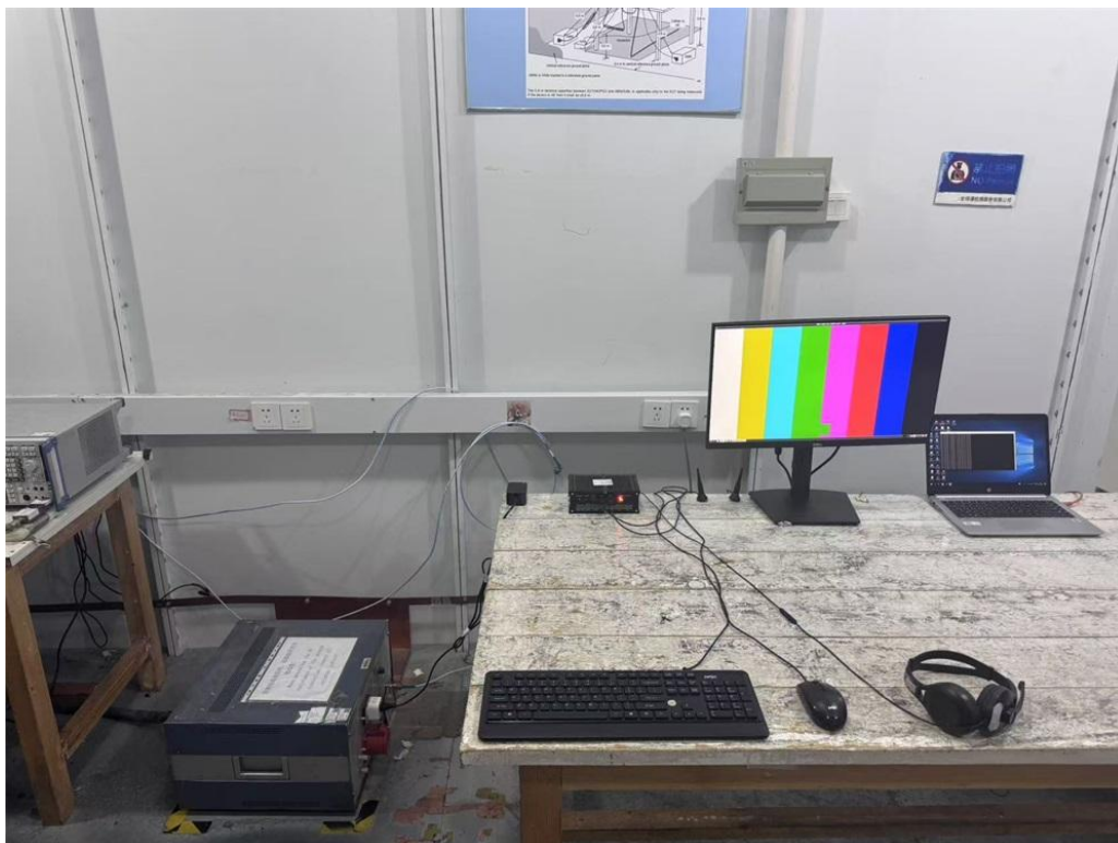
Fig. 3 Photo of DFS