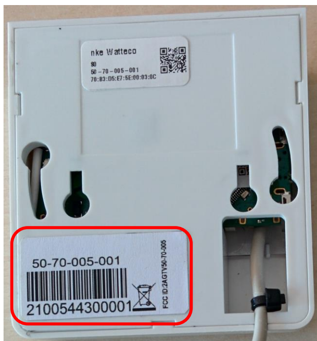
FIGURE 2 - FCC LABEL LOCATION

This label is put behind the device at the bottom in the left corner as it can be seen on the illustration here below.