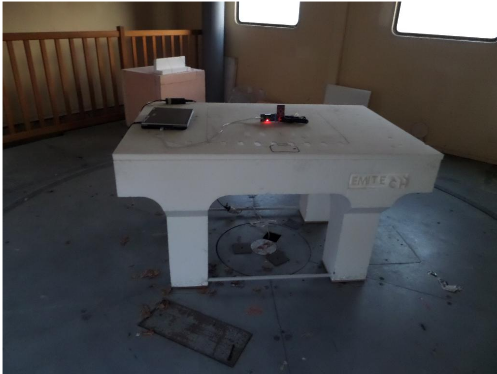
Open area test site