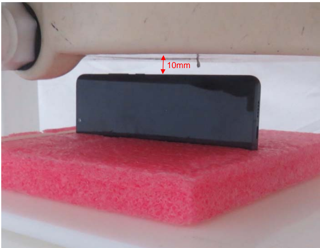
Picture 10: Right Side, the distance from handset to the bottom of the Phantom is 10mm