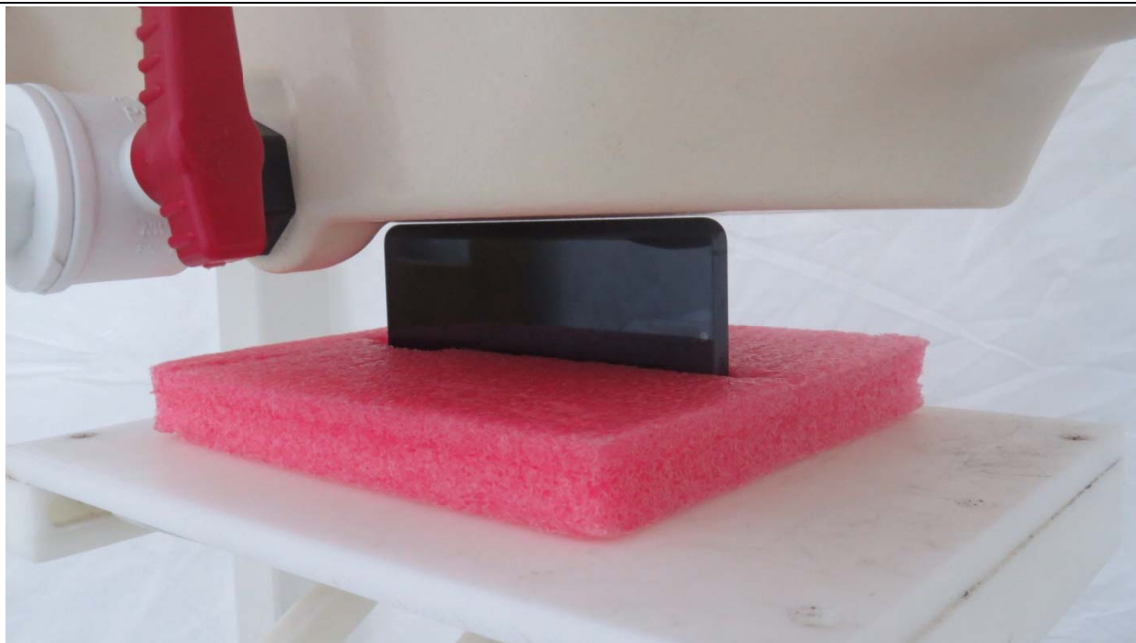
Picture 15: Left Side, the distance from handset to the bottom of the Phantom is 0mm