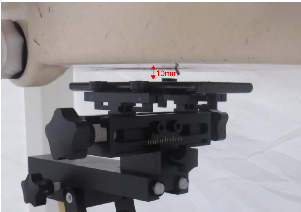
Picture 8: Front Side, the distance from handset to the bottom of the Phantom is 10mm