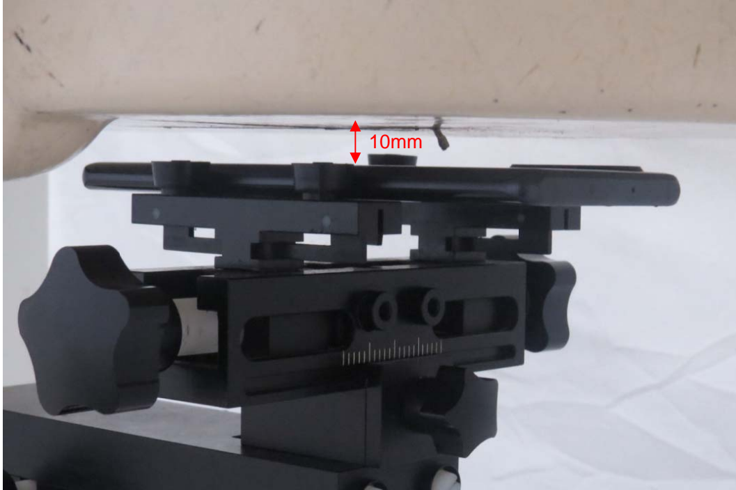
Picture 7: Back Side, the distance from handset to the bottom of the Phantom is 10mm