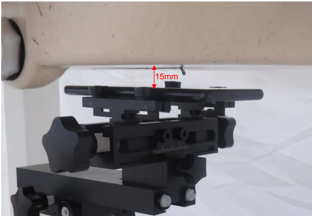
Picture 6: Front Side, the distance from handset to the bottom of the Phantom is 15mm