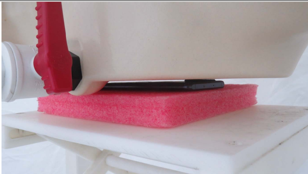
Picture 13: Back Side, the distance from handset to the bottom of the Phantom is 0mm