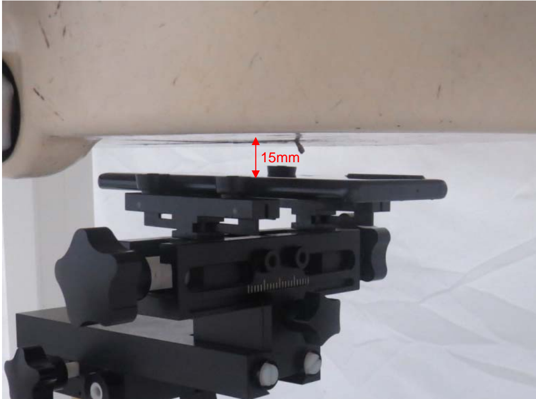
Picture 5: Back Side, the distance from handset to the bottom of the Phantom is 15mm