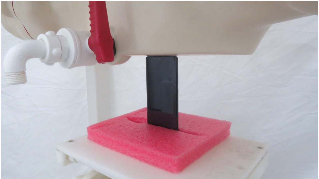
Picture 17: Top Side, the distance from handset to the bottom of the Phantom is 0mm