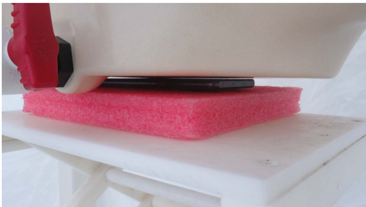
Picture 14: Front Side, the distance from handset to the bottom of the Phantom is 0mm