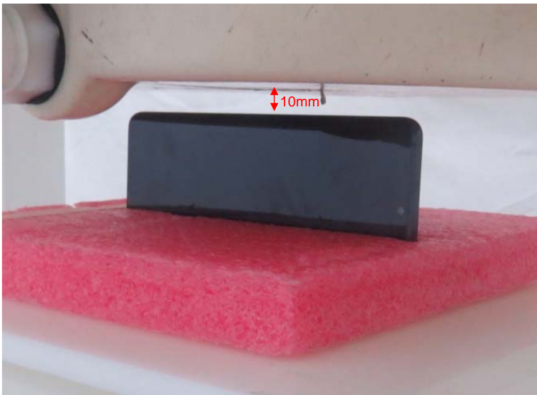
Picture 9: Left Side, the distance from handset to the bottom of the Phantom is 10mm