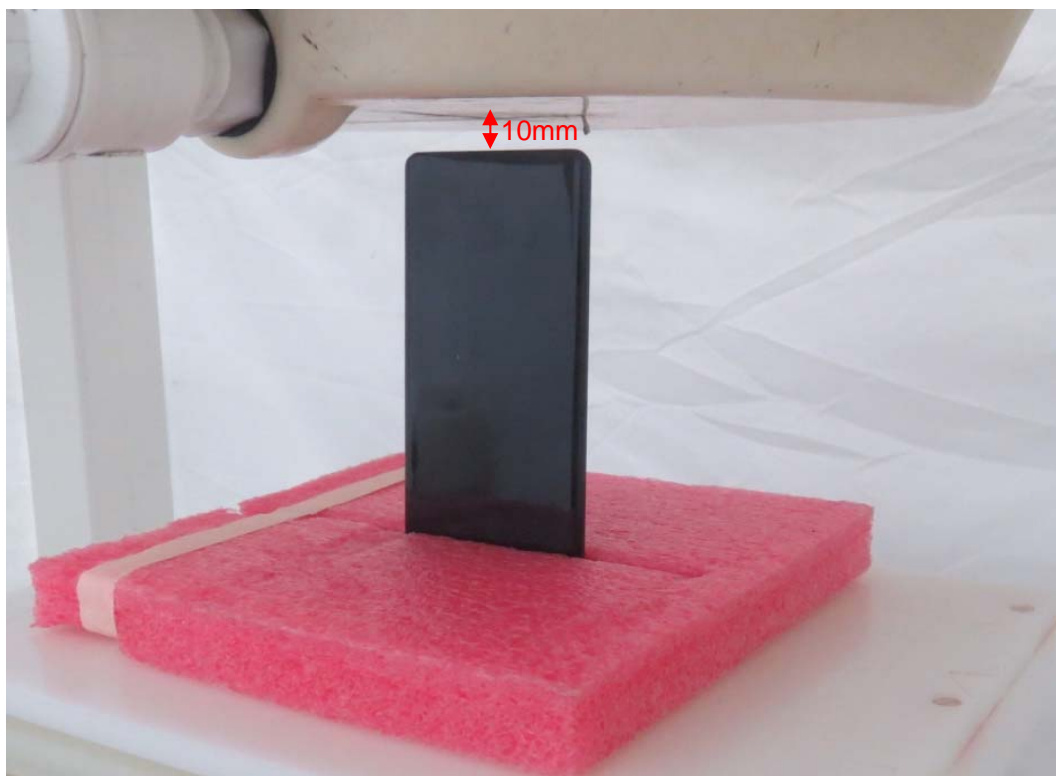
Picture 12: Bottom Edge, the distance from handset to the bottom of the Phantom is 10mm