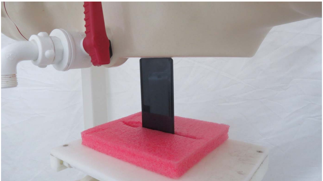
Picture 18: Bottom Edge, the distance from handset to the bottom of the Phantom is 0mm