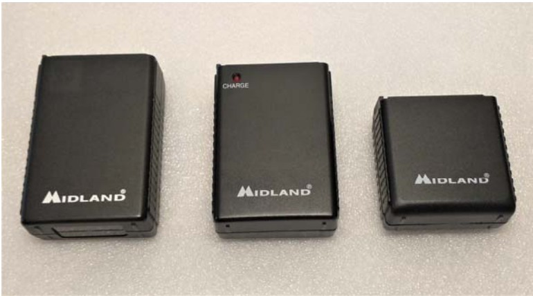
Figure D.4 Photo – P2 Open ( rechargeable USB – AA batteries x8)