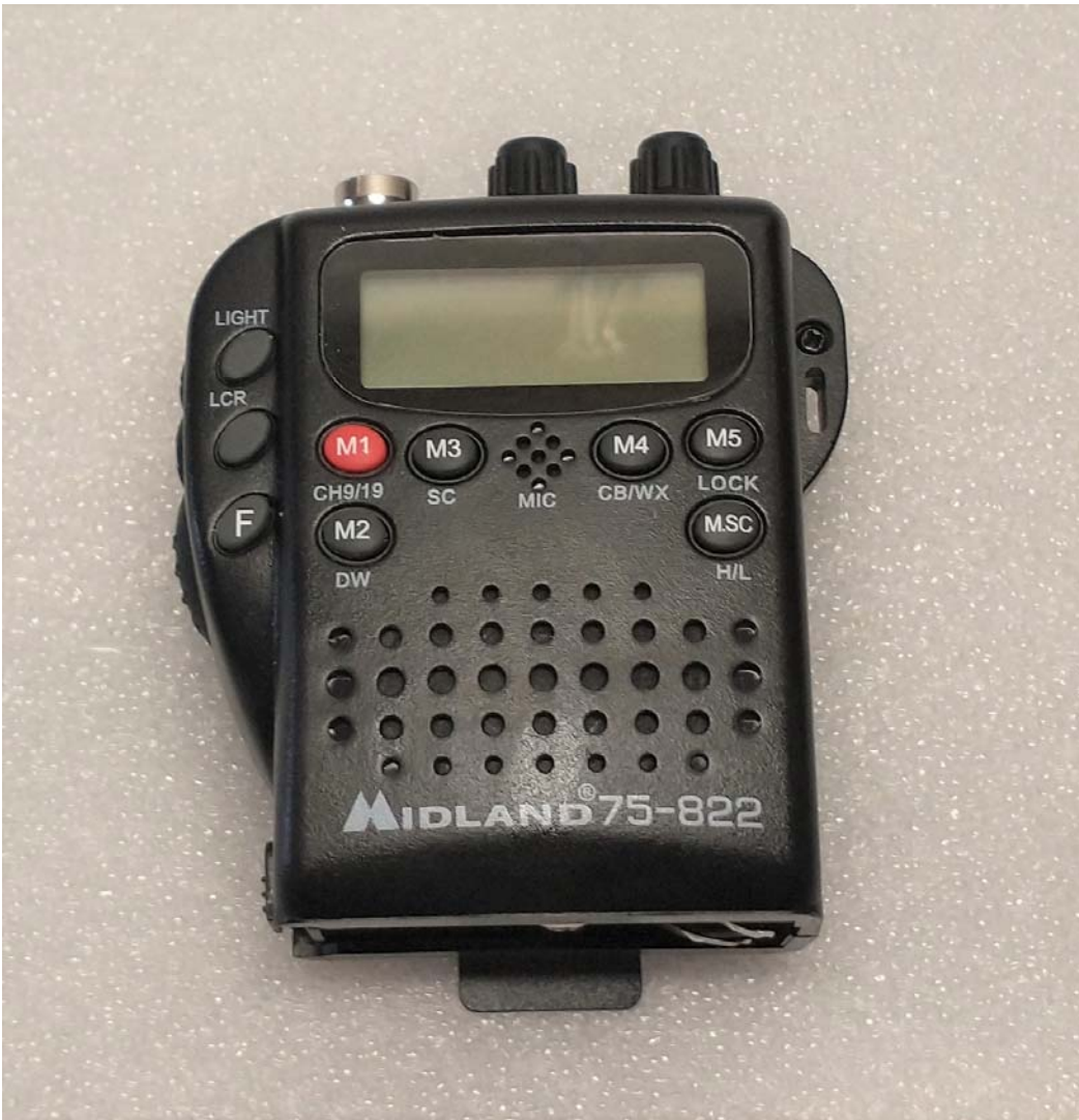
Figure D.1 Photo – 75-822 – FRONT, BOTTOM, TOP, SIDE