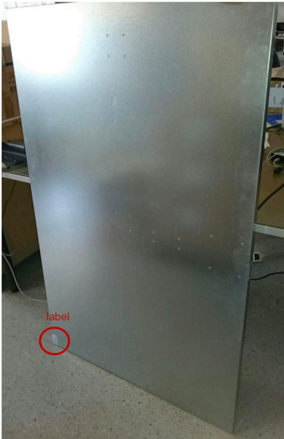
Figure 3 Position of the Label with FCC and IC ID for the LeanOrder detectionShelf

The Label with FCC and IC ID, as it is shown in Figure 1 and Figure 2, is placed on the corner of the back side of the LeanOrder detectionShelf, as shown in Figure 3.