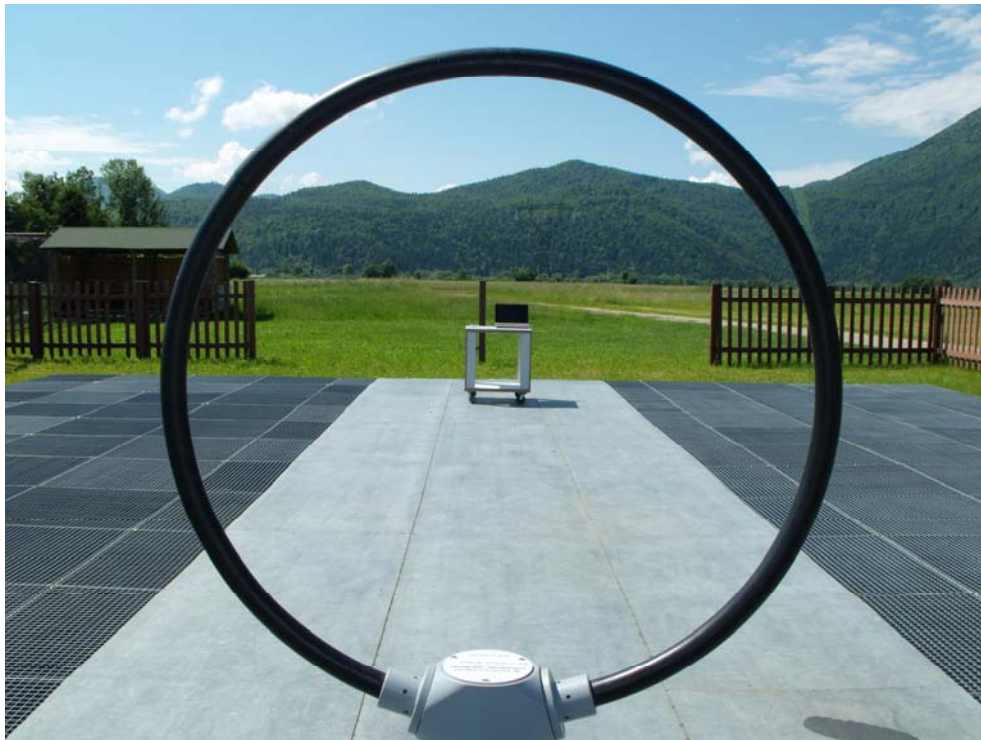
Figure 5: Radiated emission test from 9 kHz to 30 MHz on OATS