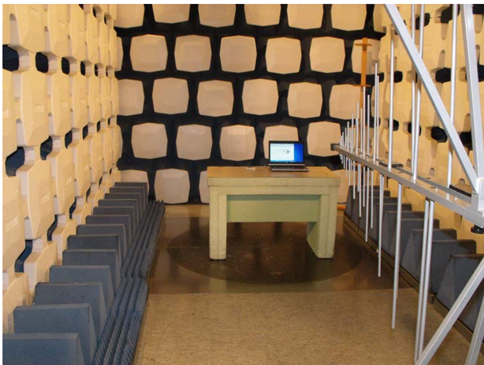
Figure 2: Radiated emission test from 30 MHz to 1 GHz in SAC