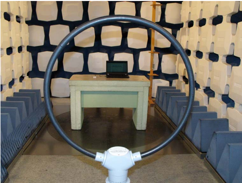
Figure 4: Radiated emission test from 9 kHz to 30 MHz in SAC