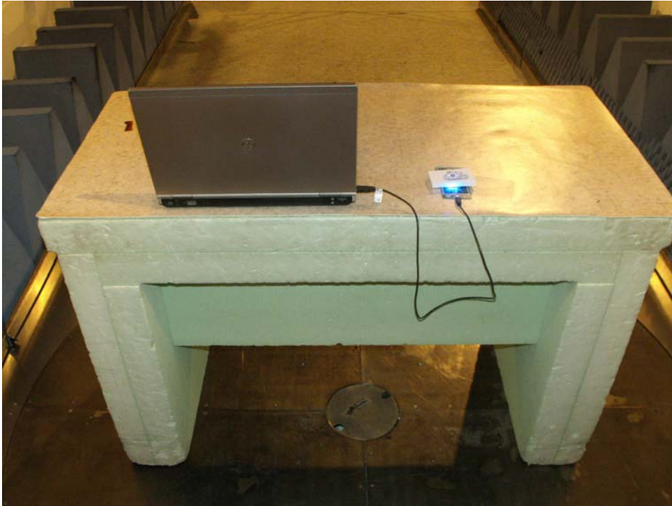
Figure 3: Radiated emission test from 30 MHz to 1 GHz in SAC