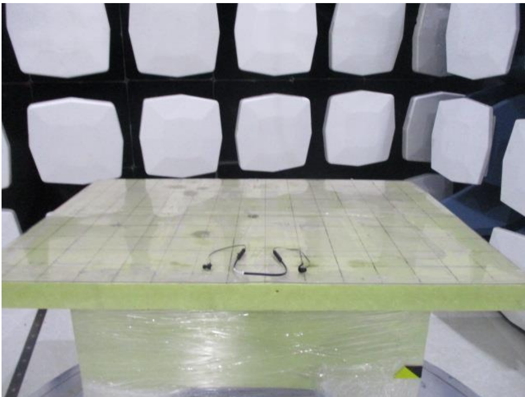
Below 1GHz (The EUT placed at the center of turntable)