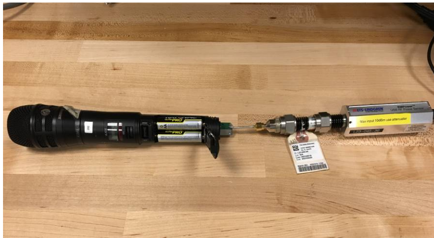
Test setup for maximum conducted output