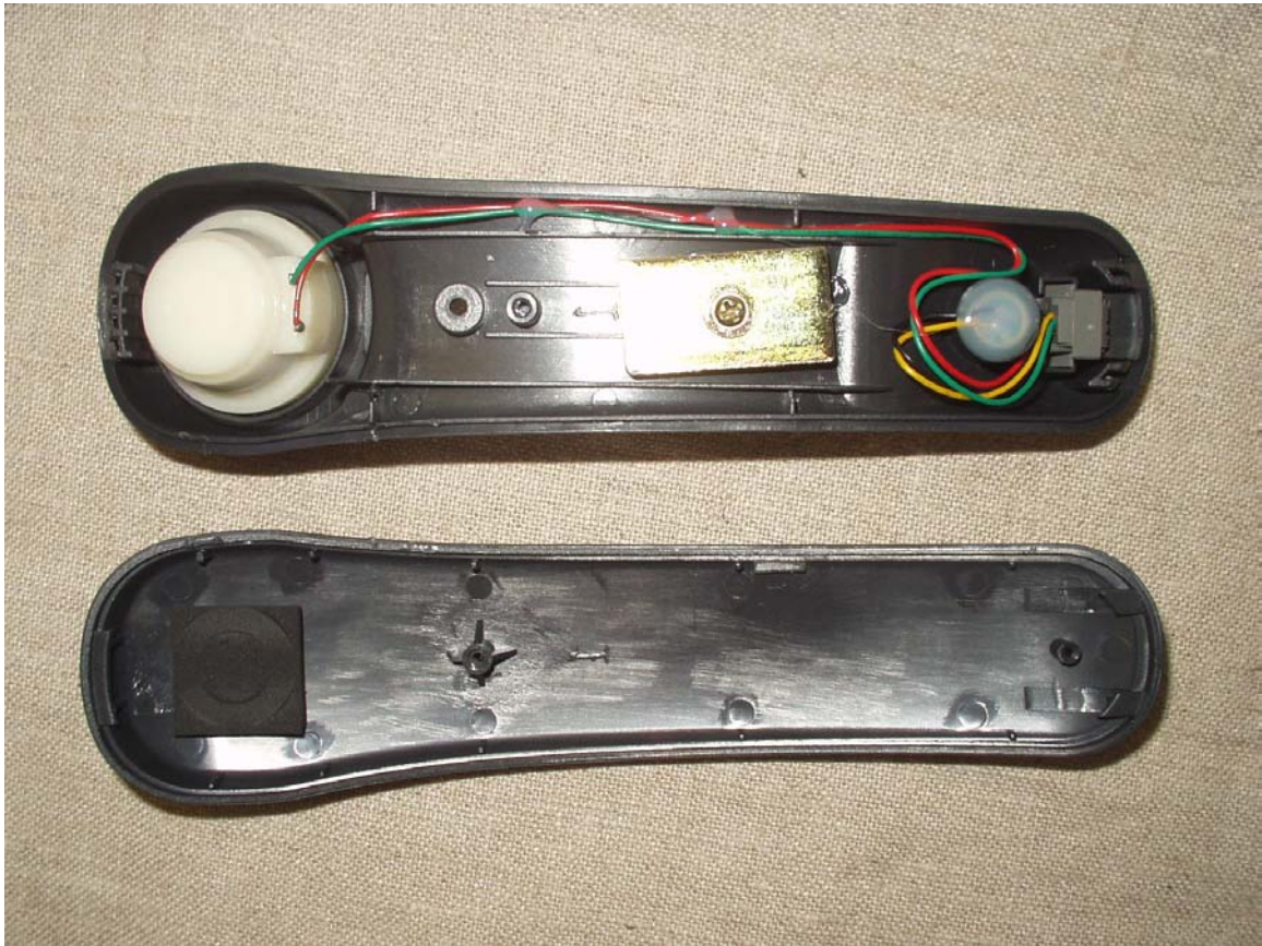
Figure 1-5: Internal photograph, Handset (top and bottom)t