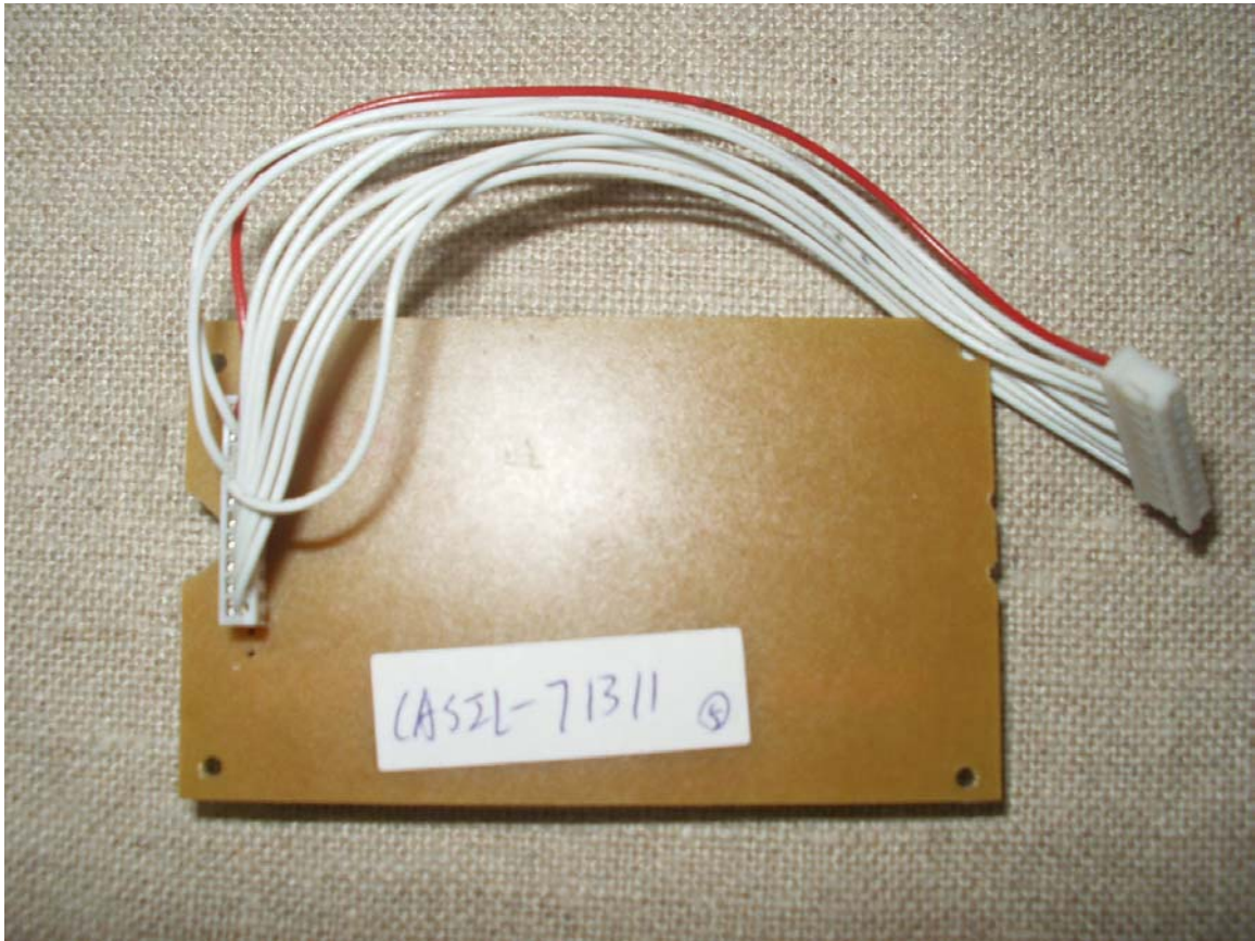
Figure 1-4: Internal photograph, LCD PCB (bottom)