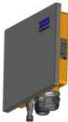
< Figure 1. MWC-915 >

It has an SFP port supporting either 1Gbps or 2.5Gbps and one 2.5 Giga Ethernet LAN port interface. And Passive PoE operation using LAN port is possible. (Type 48V)