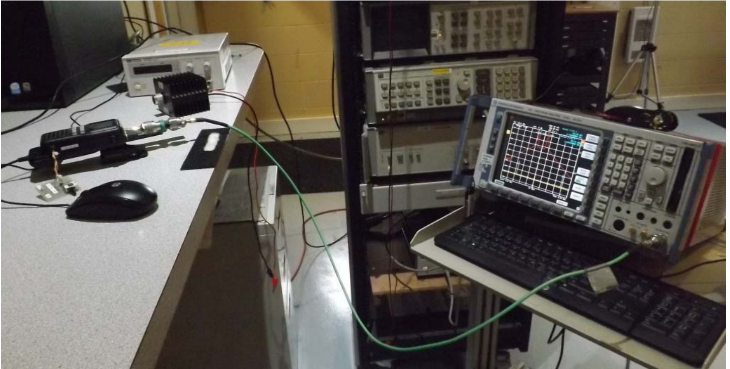
Figure E23.1 – Setup, Conducted Measurements