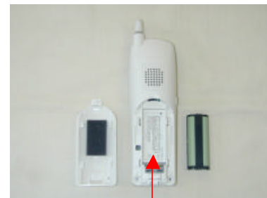
FCC ID Label

The marking will be shown on the battery compartment of the portable unit.