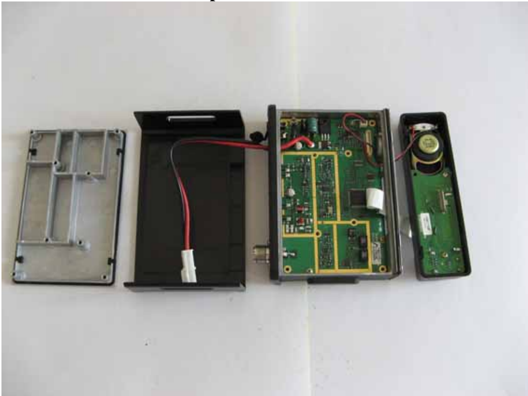
Internal view of EUT-1