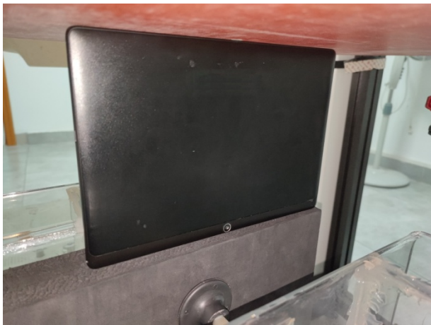
Bottom with Phantom (0mm)