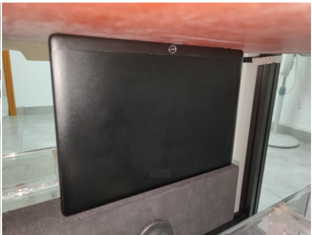
Top with Phantom (0mm)