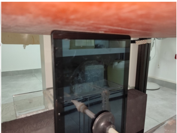
Right with Phantom (0mm)