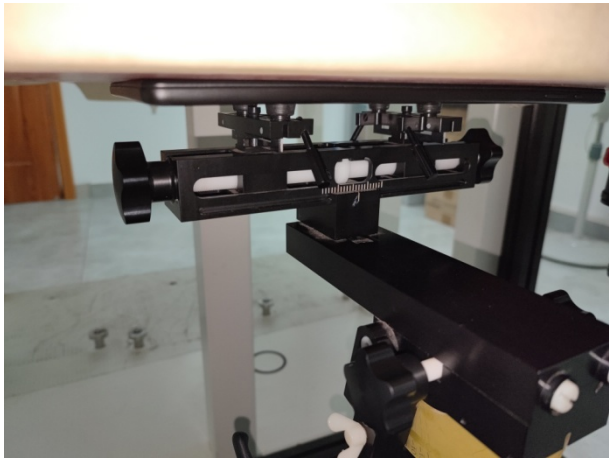
Front with Phantom 0 mm