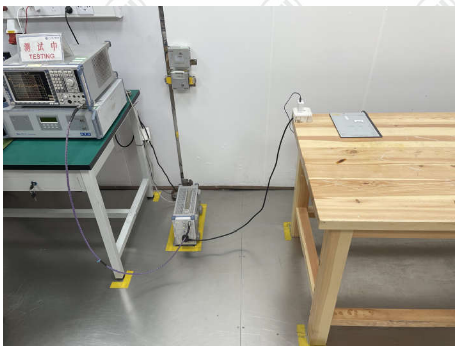
Conducted emission Test Setup