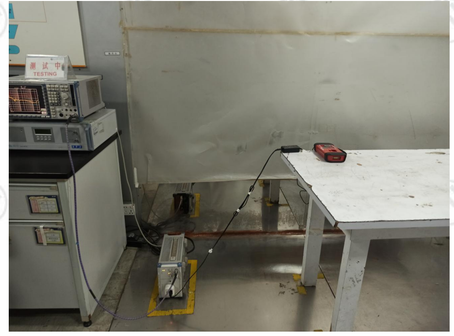
Conducted Emissions Test Setup