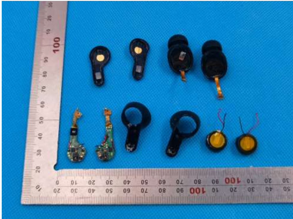
VIEW OF BATTERY