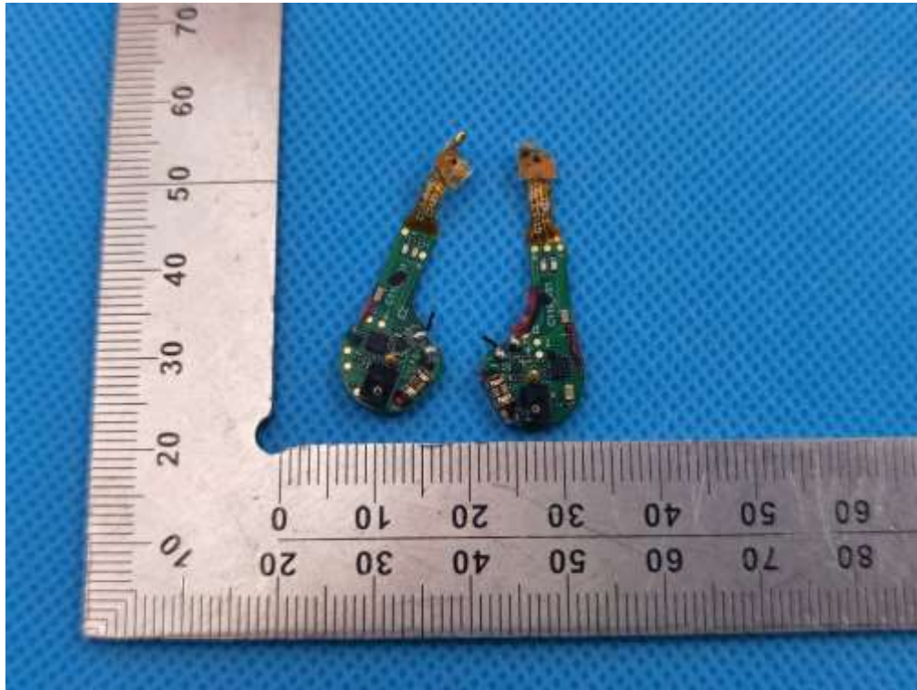
INTERNAL VIEW OF EUT (FIGURE 2)