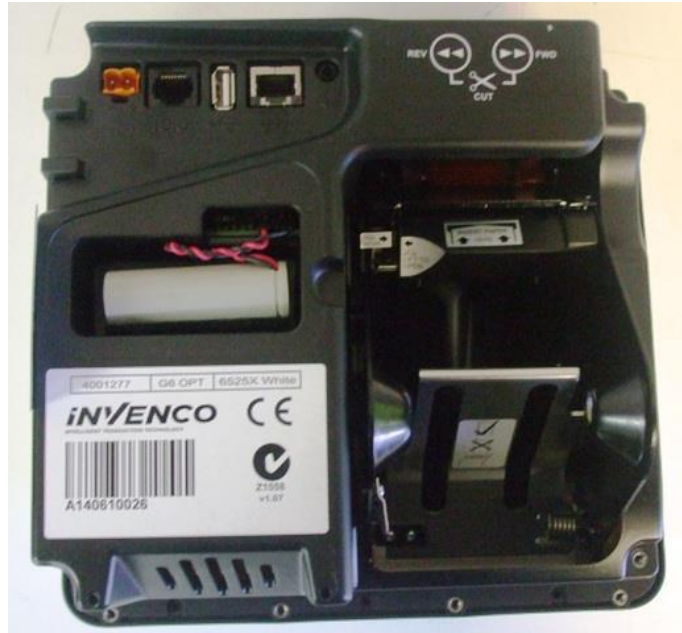
Figure 2 Photograph of same label material and size place on unit