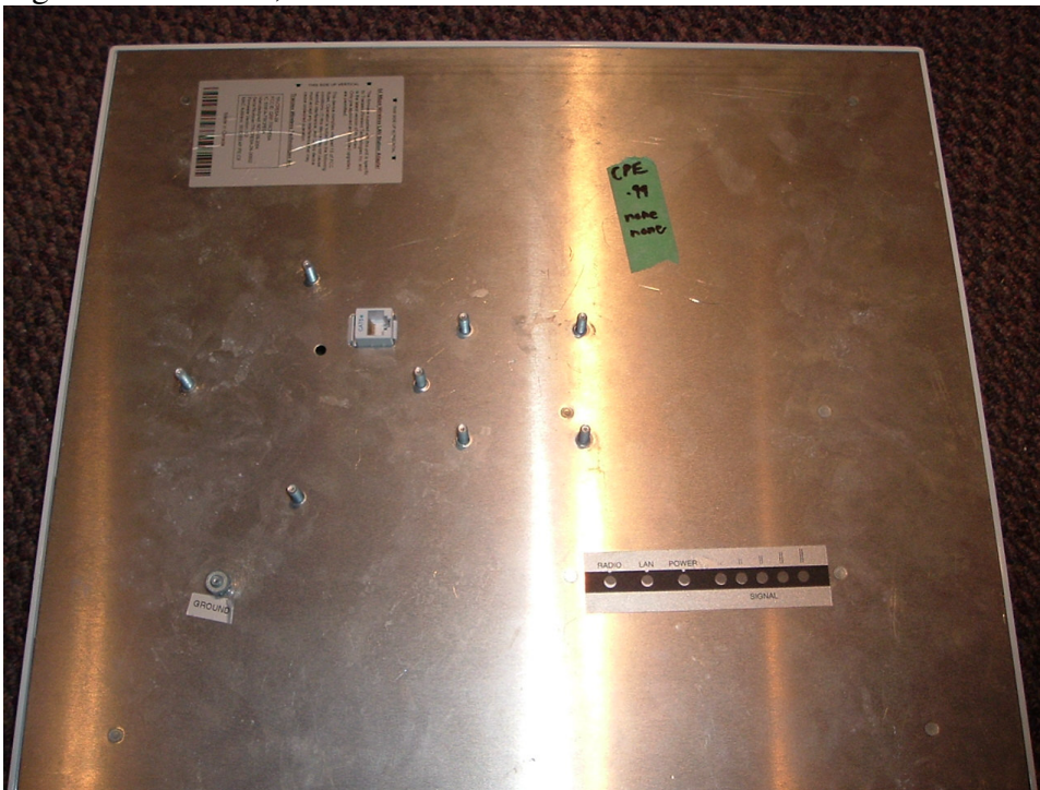
Figure 2 – External, Back panel of unit.