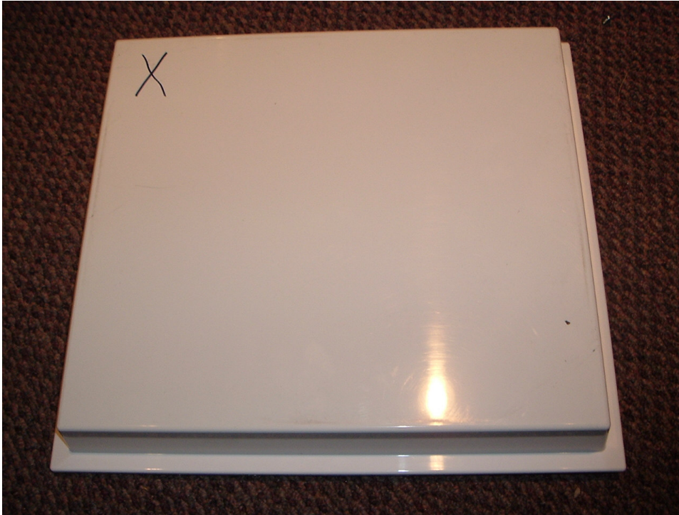
Figure 1 – External, sealed front cover of unit