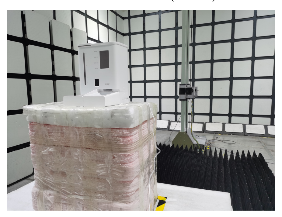
Radiated Emissions View (18-40 GHz)