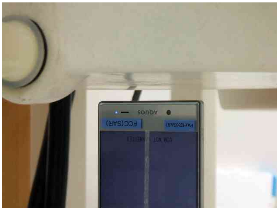
– Bottom Edge –