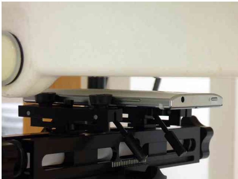
– Rear Side –