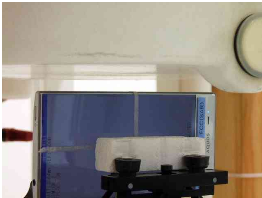
– Right Edge –