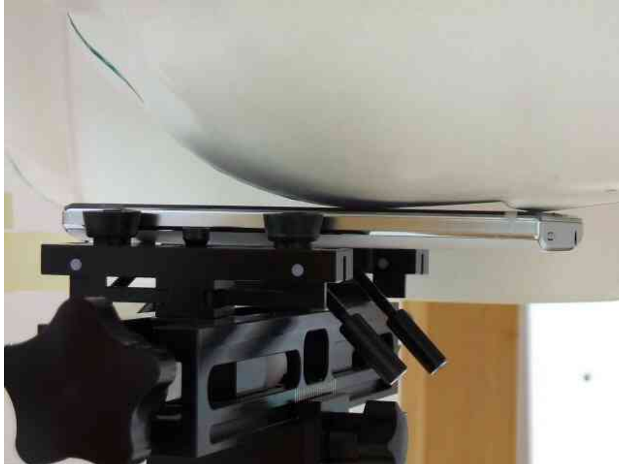
– Cheek-Touch Position –