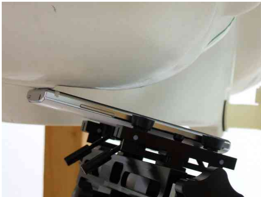
– Ear-Tilt Position –