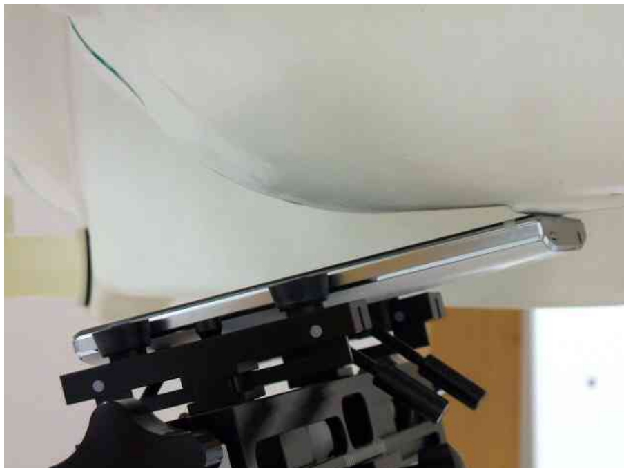
– Ear-Tilt Position –