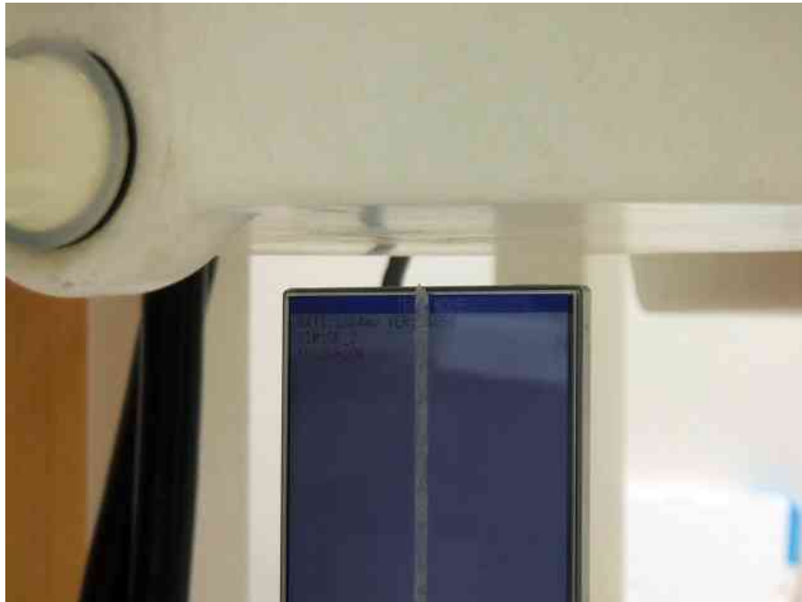
– Top Edge –