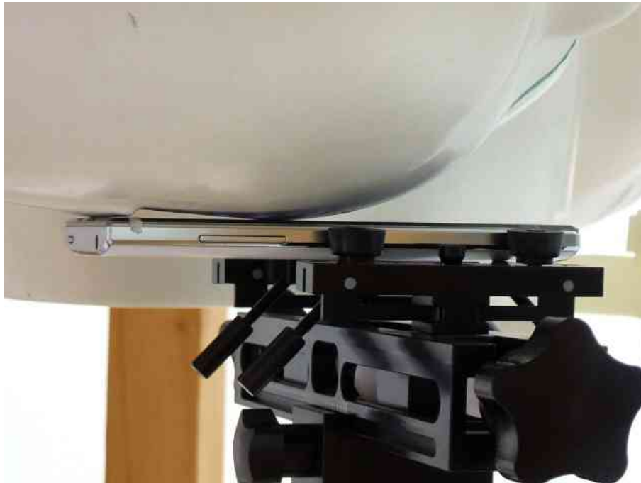
– Cheek-Touch Position –