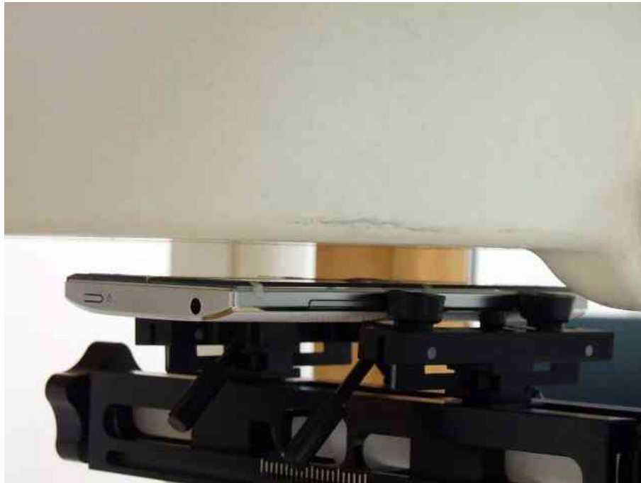
– Front Side –